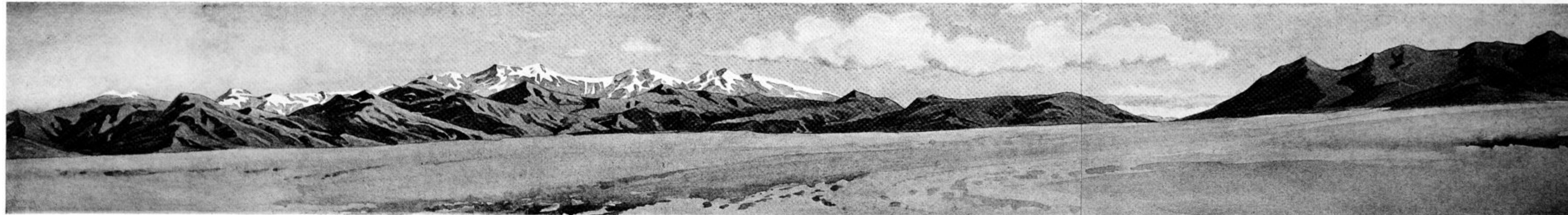
DIE GEBIRGE VON DSCHAFARU, LAGER XXXII