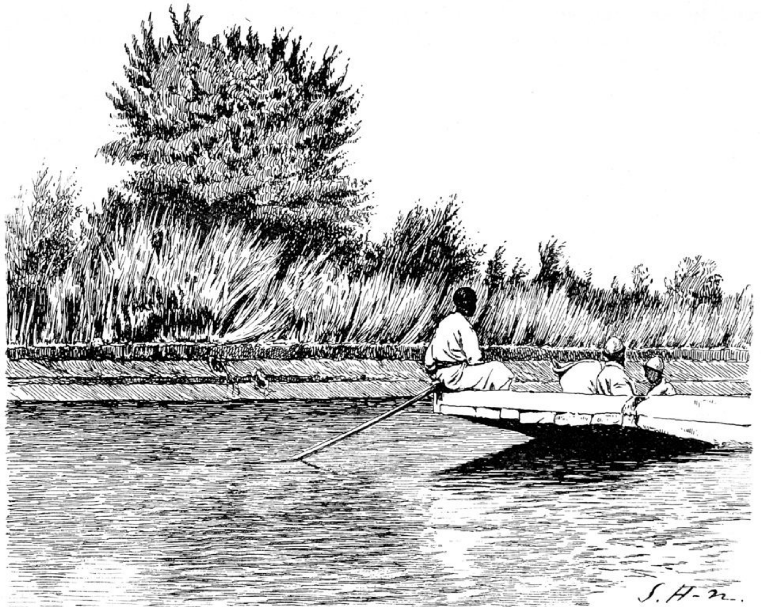
Fig. 56. HIGHWATER MARKS ON THE BANKS OF JARKENT-DARJA.

a marginal lagoon two days' journey lower down the river, known as the Jantak-köl. It was reported to be then empty, though it had been filled with water at the period of high flood. The upper part of this side-arm bears the name of Jantak-köl-aghsi. During the course of the day we passed the following forest-tracts — Siva-kotan, Kämpä, Jätim-kirlidi, and Milka. In the last-named locality we observed a masar, situated amongst some sand-dunes, scantily covered with vegetation. Here on the left bank was a shepherds' track, running from the Kodaj-darja to Avat and Ak-su. At this place the river was 56.7 m. broad, and had a mean depth of 0.685 m., a mean velocity of 0.5533 m., and a volume of 21.49 cub. m., in the second.