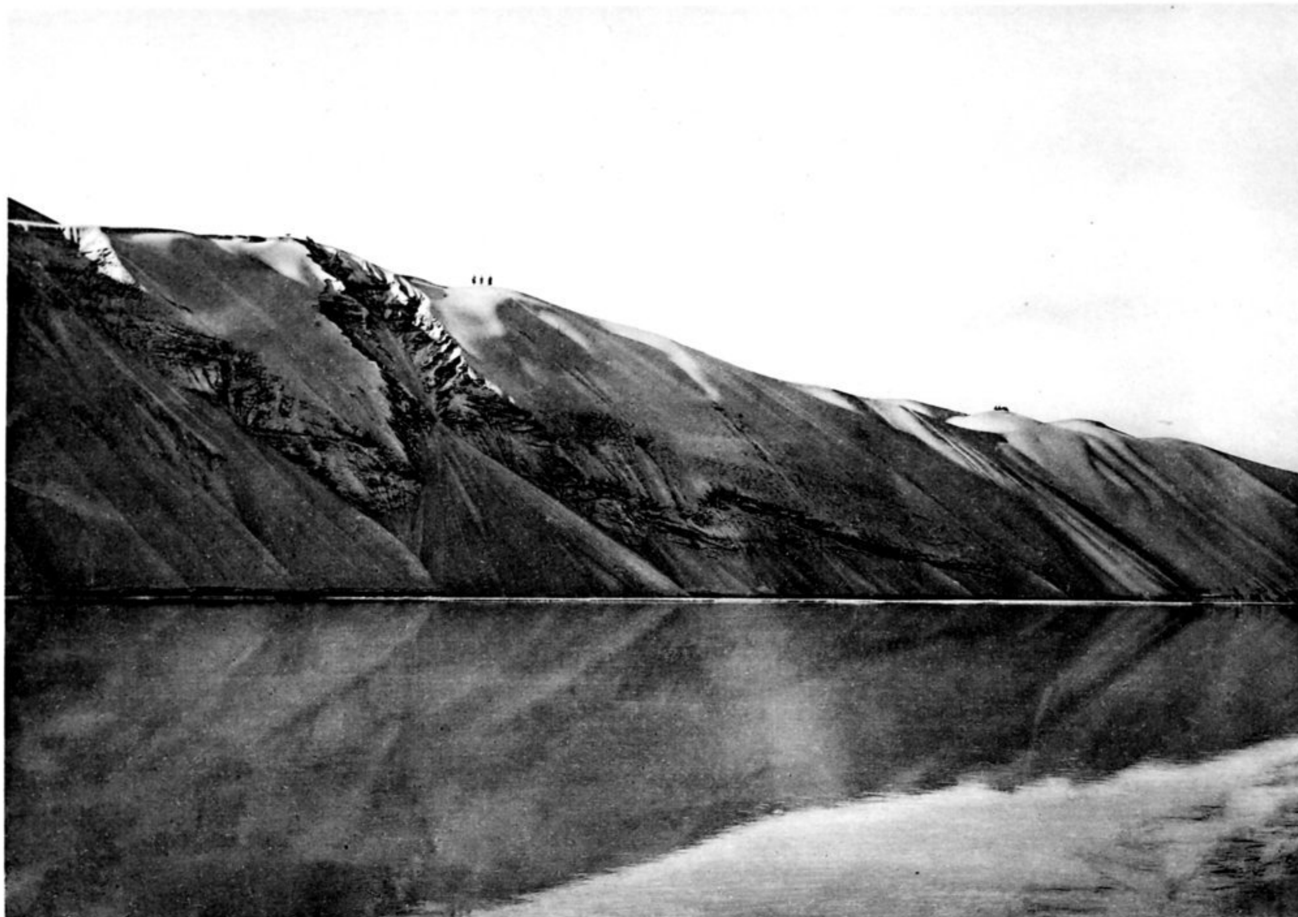
VIEW OF THE TOKUS-KUM, FROM THE LEFT BANK, LOOKING S.W.