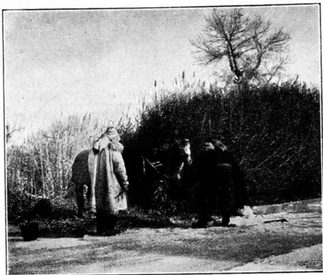
Fig. 351. GIVING THE HORSES A DRINK.

On 10th February there was a fresh north-east wind. The surface was sandy, and at intervals there were mounds bearing dead or living tamarisks. The patches of schor that we crossed were surrounded by them and by low sand, giving them some resemblance to bajirs. The high sand is here about 3 km. distant from the existing river-bed; indeed it is surprising it has not yet quite reached it. It seems to fight shy of the belt of lean and scanty steppe, for it terminates quite abruptly, forming a continuous wall, the silhouette of which showed that the dunes turn their