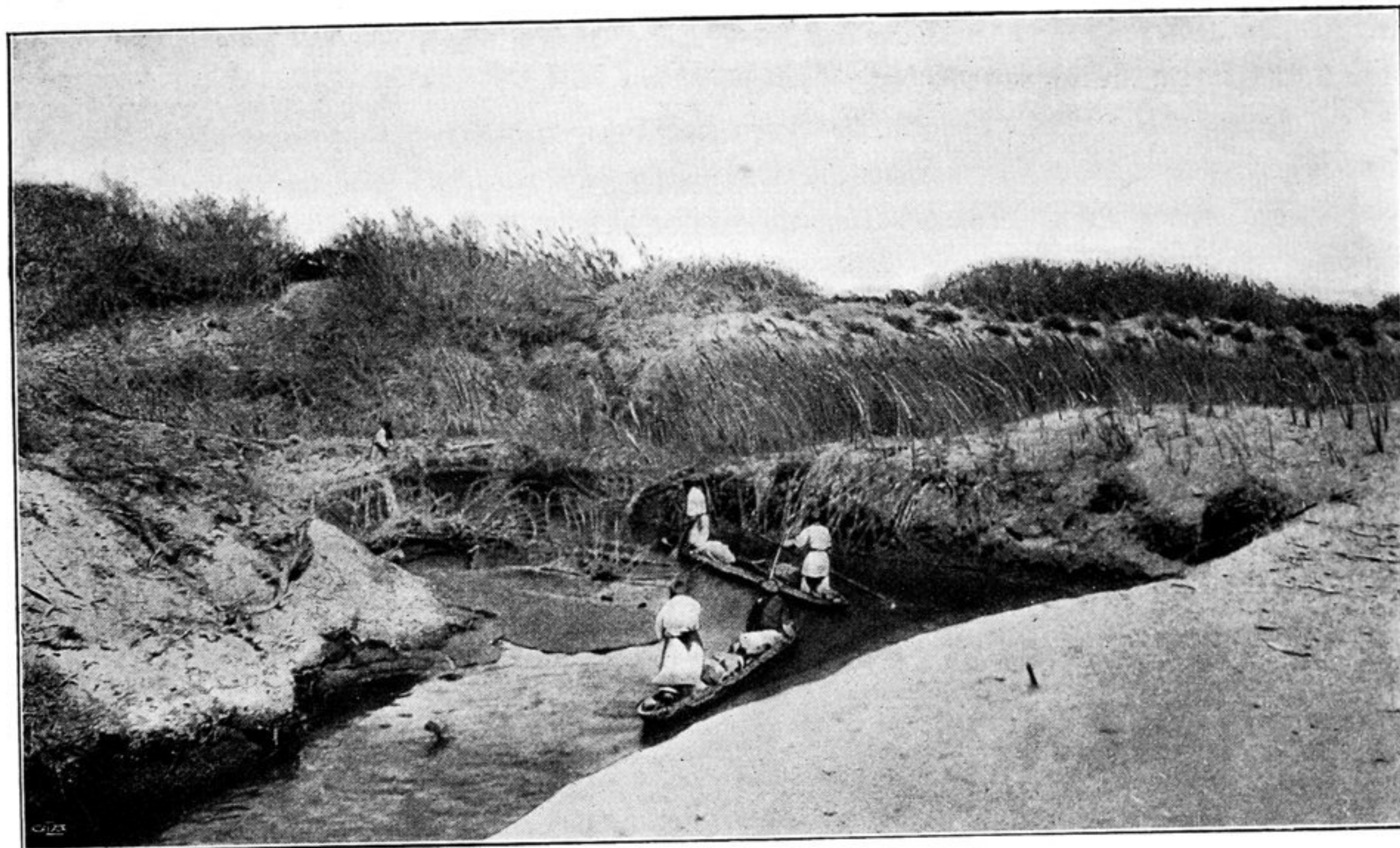
Fig. 395. THE KOK-ALA BETWEEN KULTUK-KÖLI AND SCHIRGE-TSCHAPGHAN.