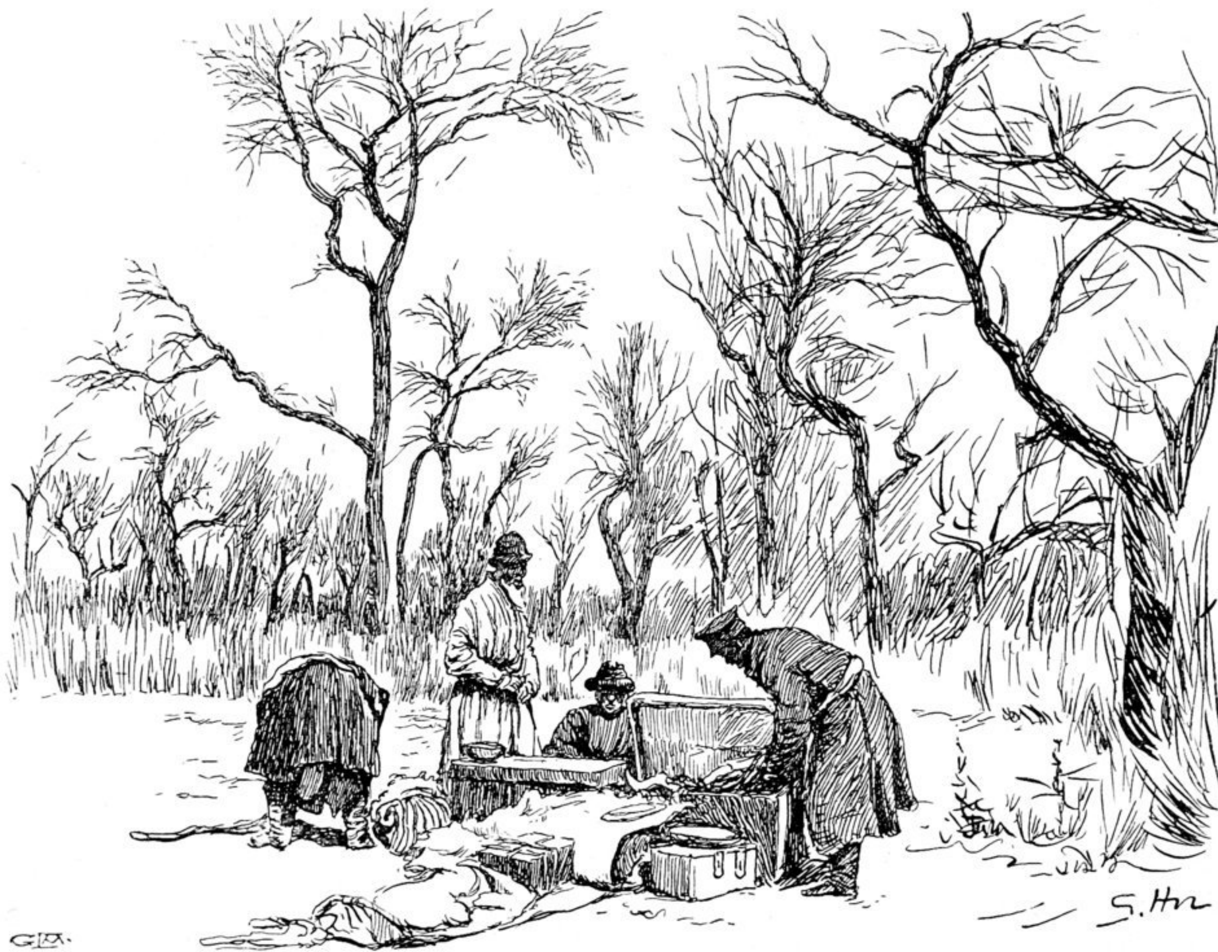
Fig. 5. FOREST AT DILPAR.

found to obtain in the case of the Tarim; for, whereas it is the right bank of the latter that runs next the desert, the Kontsche-darja has the desert on its left bank. South-west of the Tarim we found the country low and plentifully indented with depressions; but in the case of the Kontsche-darja it is the north-east, or outer, bank that is higher. This circumstance apparently contradicts the proposition I have already laid down (vol. I p. 302), namely that the inter-riverine tract between the Kontsche and the Tarim forms, in relation to the adjacent desert, a sort of low terrace, or in other words, that