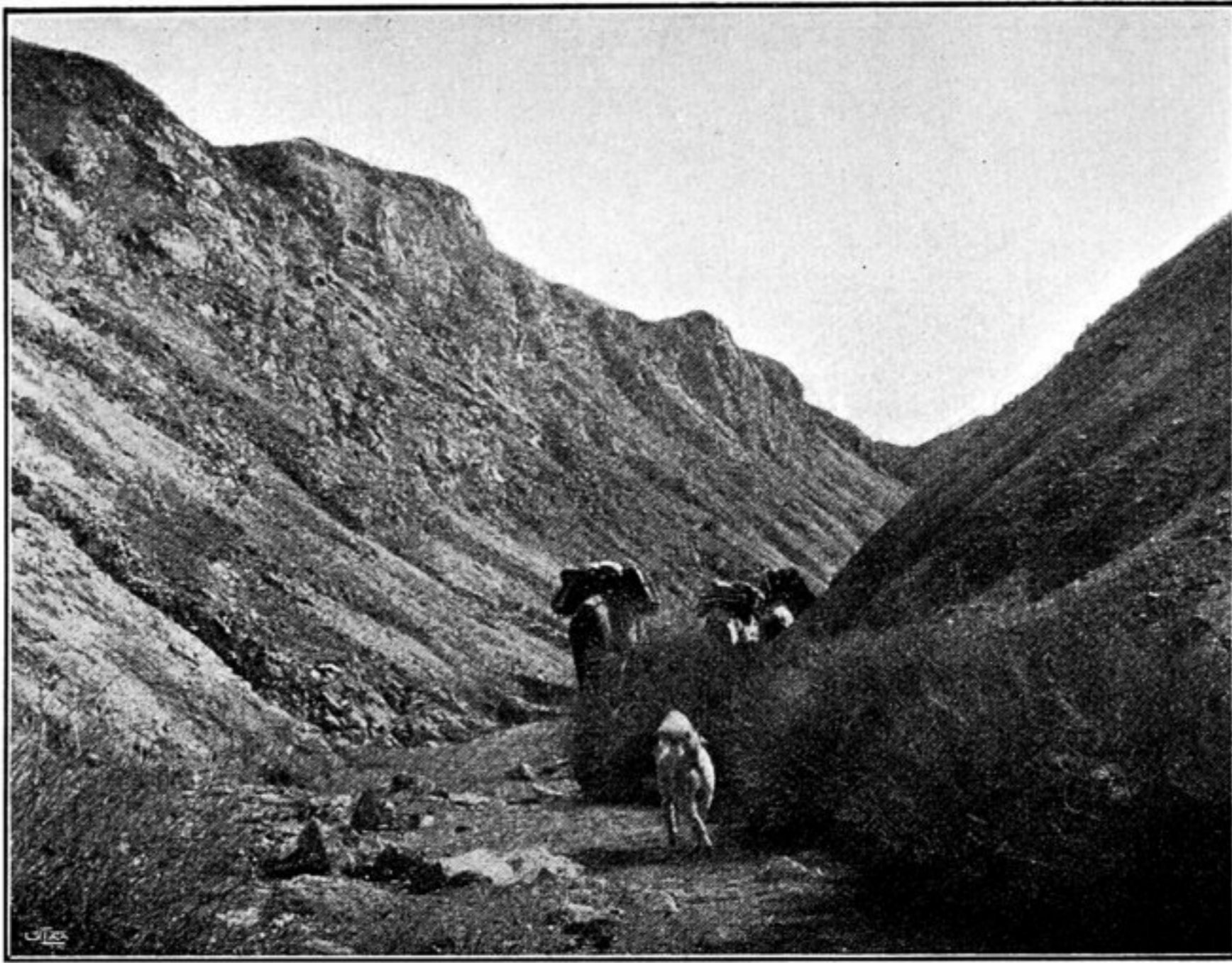
Fig. 20. SCENERY IN THE VALLEY S.E. OF KURBANTSCHIK.

crossed it by the Turfan route viâ Singer, Grum-Grschimajlo crossed it between Luktschin and Olun-temen-tu, and I crossed it farther to the east. This has made indeed a great part of the system known; but the western parts depicted on our maps are certainly incorrect, if not imaginary. Grum-Grschimajlo* shows on his