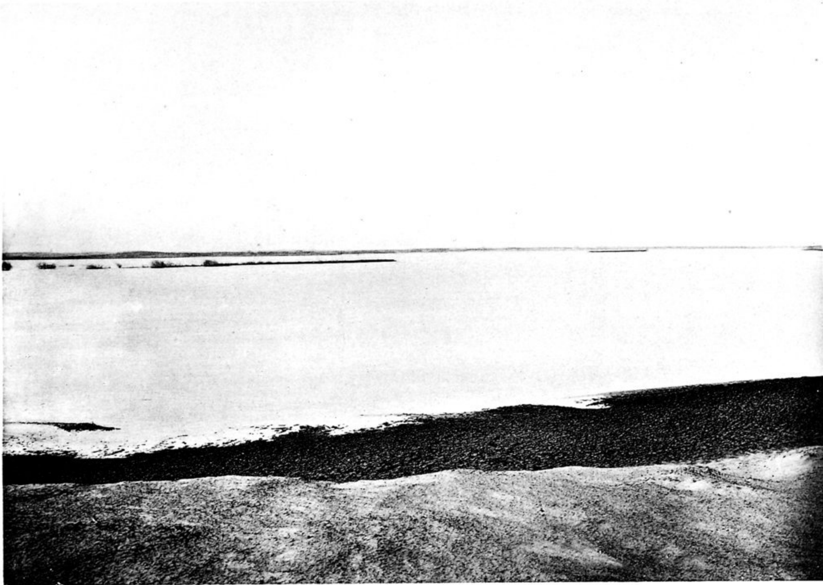
WESTERN SHORE OF NEW DESERT LAKE NORTH OF KARA-KOSCHUN. CAMP CLXVI.