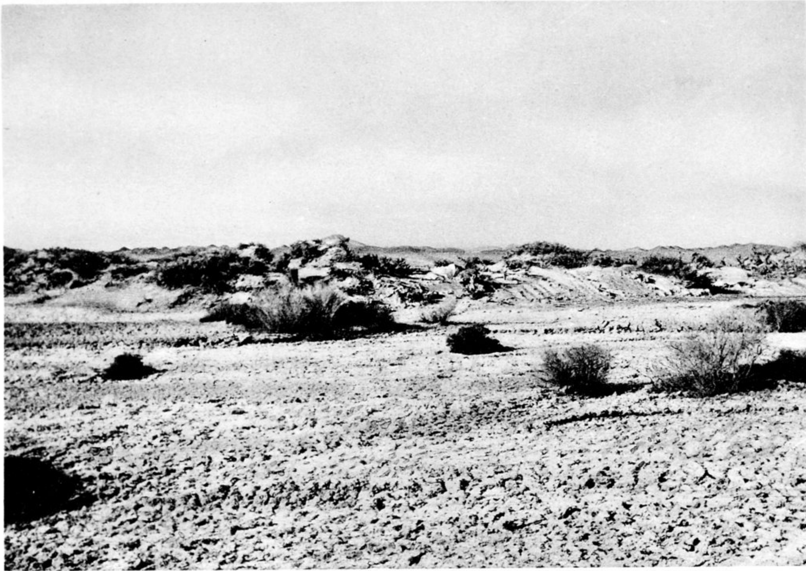
LITTLE OASIS JUST ABOVE CAMP CXLII, FEB. 10TH 1901.