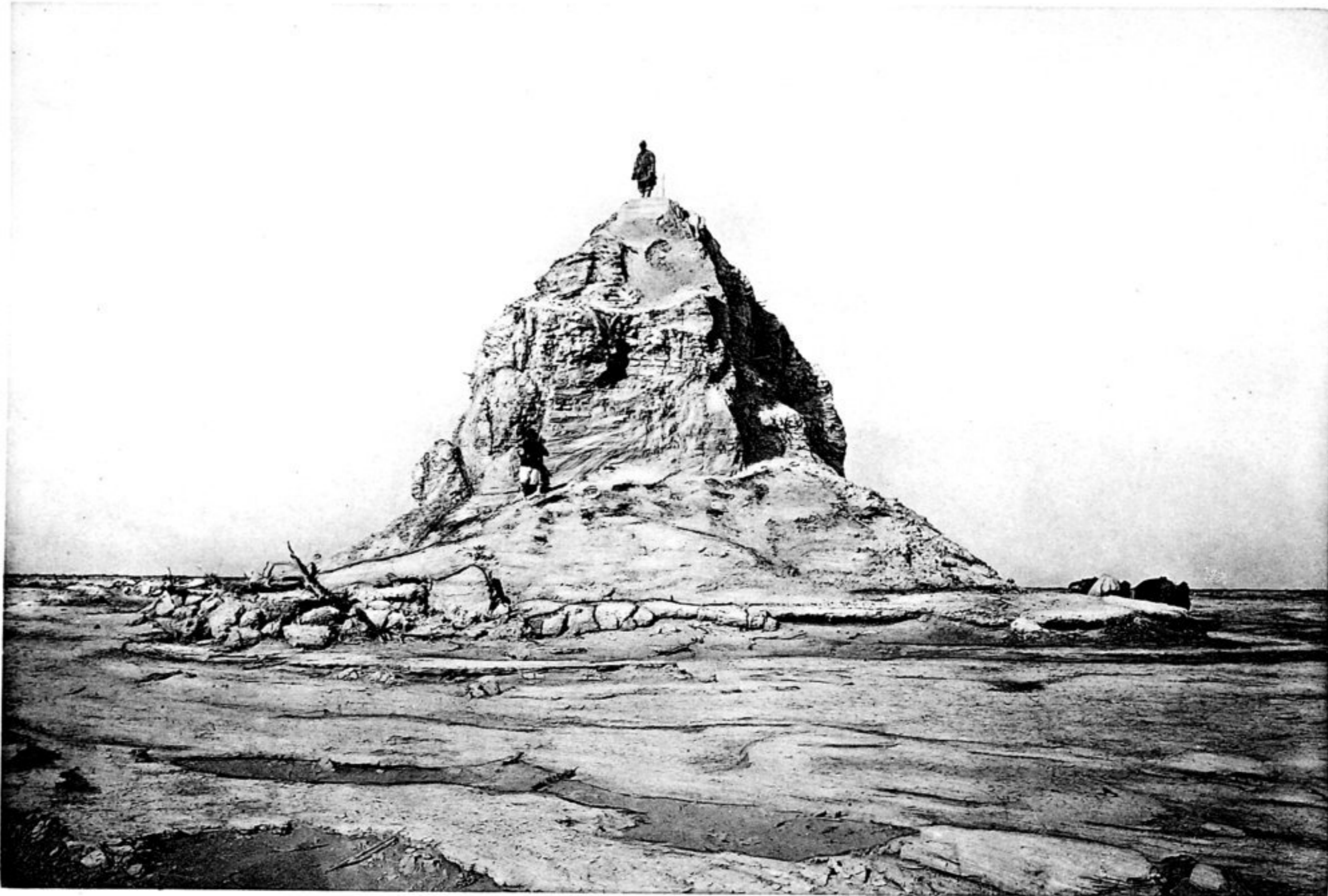
SOLITARY TOWER OF MARCH 3RD 1901.