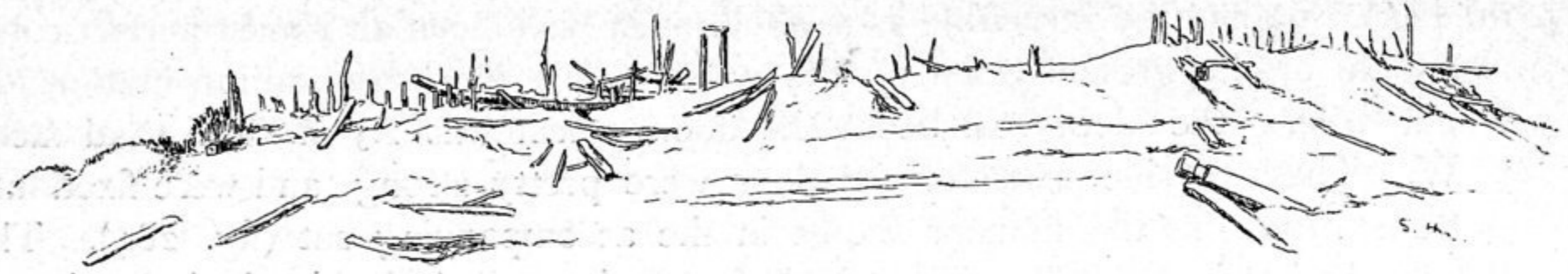
Fig. 280. VIEW OF THE BIG HOUSE.

fectly level and horizontal ground. The two mounds and the hollow between them, as also the depressions on their outer sides, all came into existence at a subsequent date. The mortice cut (see fig. 281) on the under side of the extreme end of the cross foundation-beam proves that the longer side-beam was placed under the cross-beams, which again were likewise fitted into mortices cut in the long beam. This latter now lies in a condition such as to be hardly recognisable at the eastern base of the platform, where it has fallen since the underlying ground was excavated and blown away. At the present time the ends of the cross-beams project about 3 m. beyond the platform, and the wind is still continuing its undermining work. But the timber that still remains on the top of the platform, equally whether it belonged to the foundation-beams or to portions of the walls and roof which have fallen in, affords an efficient protection to the platform, and sufficiently neutralises the effects of the wind's erosion. It is on these platforms alone, then, that the surface remains at the same level that it stood at when these houses were built. Another proof that nothing but the wind can have carved out these platforms is to be