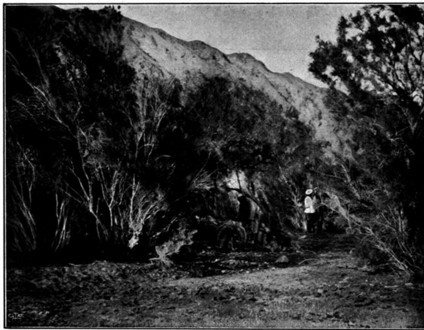
Fig. 4. BIG TAMARISKS IN THE VALLEY OF TATLIK-BULAK.

saw, and which were then absolutely dry, imparted an increasingly rugged aspect to the mountain scenery. The track ran up and down over the hills, ridges, and side-spurs of every shape and size, all built up of the same soft material and furrowed by thousands upon thousands of dry torrents. Here too the dark green schist predominates, though it only crops out at the points where the sides of the watercourses