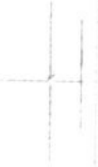
THE GREAT GLACIATED MOUNTAIN - MASS south of Camp XXII, Aug. 6 th