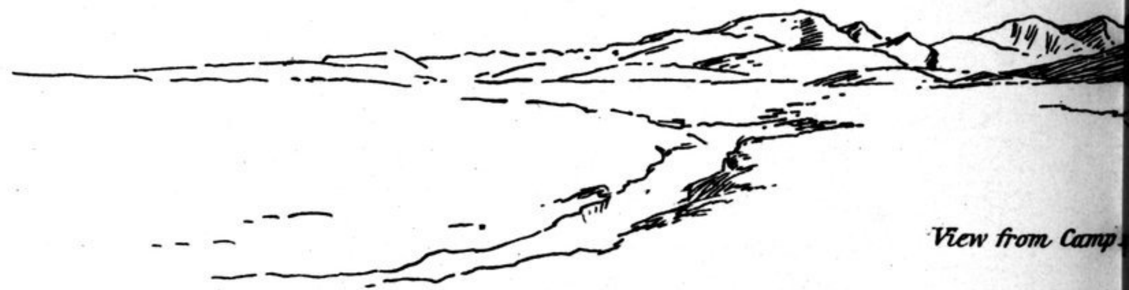
View from Camp