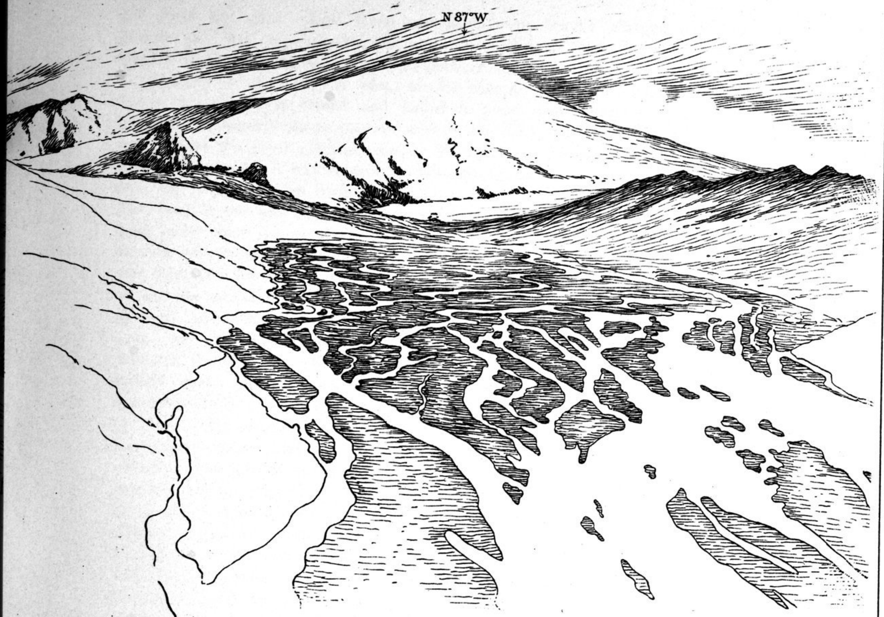
View of the Glacier-mountain from Camp XXVIII. August 18 th