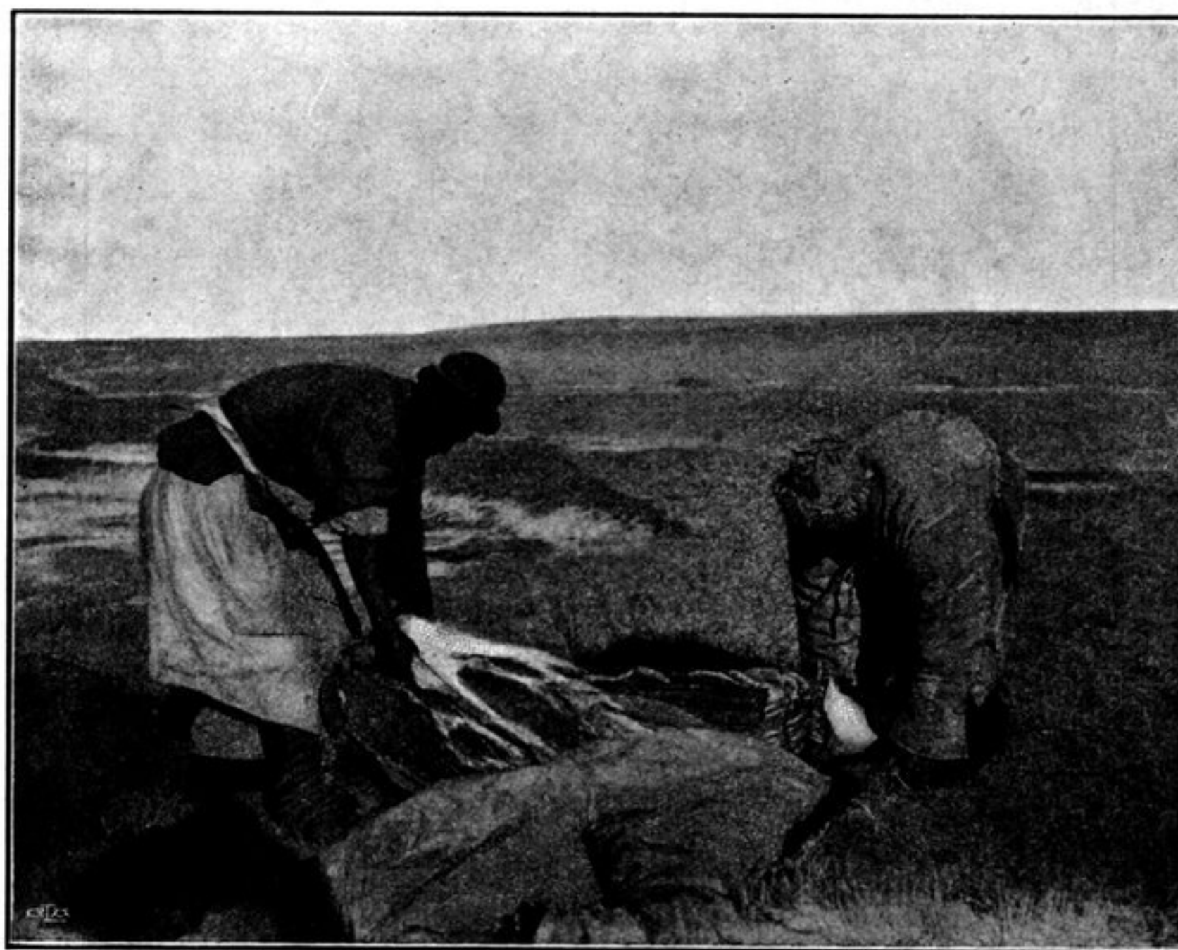
Fig. 120. SCENES FROM THE BURIAL OF ONE OF MY MEN AT CAMP LVI.

Camp LV. There is only one cape of any size, and it consists of mud, formed by the deltaic arms of a brook. East and west of it are a couple of intensely salt lagoons lying quite close to the shore; the shore itself consists of gravel and sand, and is perfectly hard and solid. The water is, as I have just said, intensely salt, yet