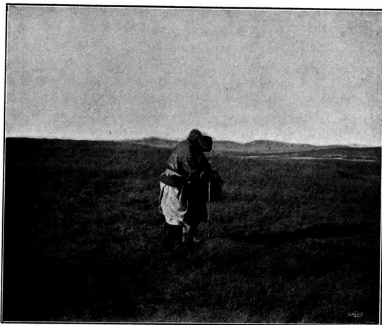
Fig. 121. SCENES FROM THE BURIAL OF ONE OF MY MEN AT CAMP LVI.

This lake is about 15 km. long, its western end being rounded, and shallow, as well as plentifully studded with mud islands and so diversified with capes that it is impossible to make out the actual shore-line. It lies at an altitude of 4800 m. Immediately west of it the ground is flat and whitened over with incrustations of salt; here too there were pools. All this water appeared to have been left after the lake