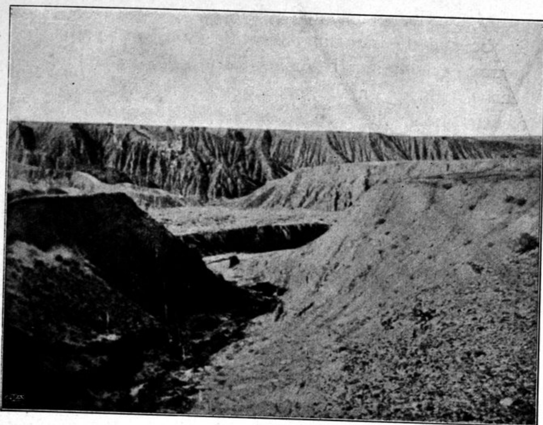
Fig. 214. CHARACTERISTIC MOUNTAIN-SCENERY OF AKATO-TAGH.