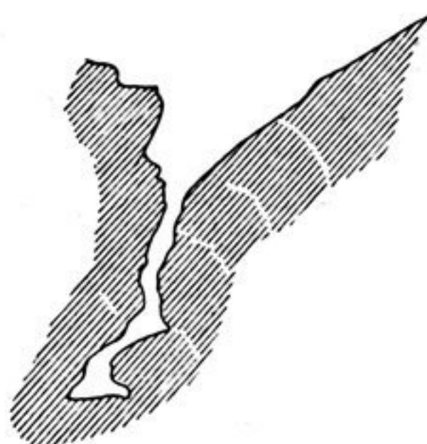
Fig. 217. TWO STOREYS.

squeezing himself past. But fortunately the hills and declivities on the right-hand side of the glen afforded a means of advance.