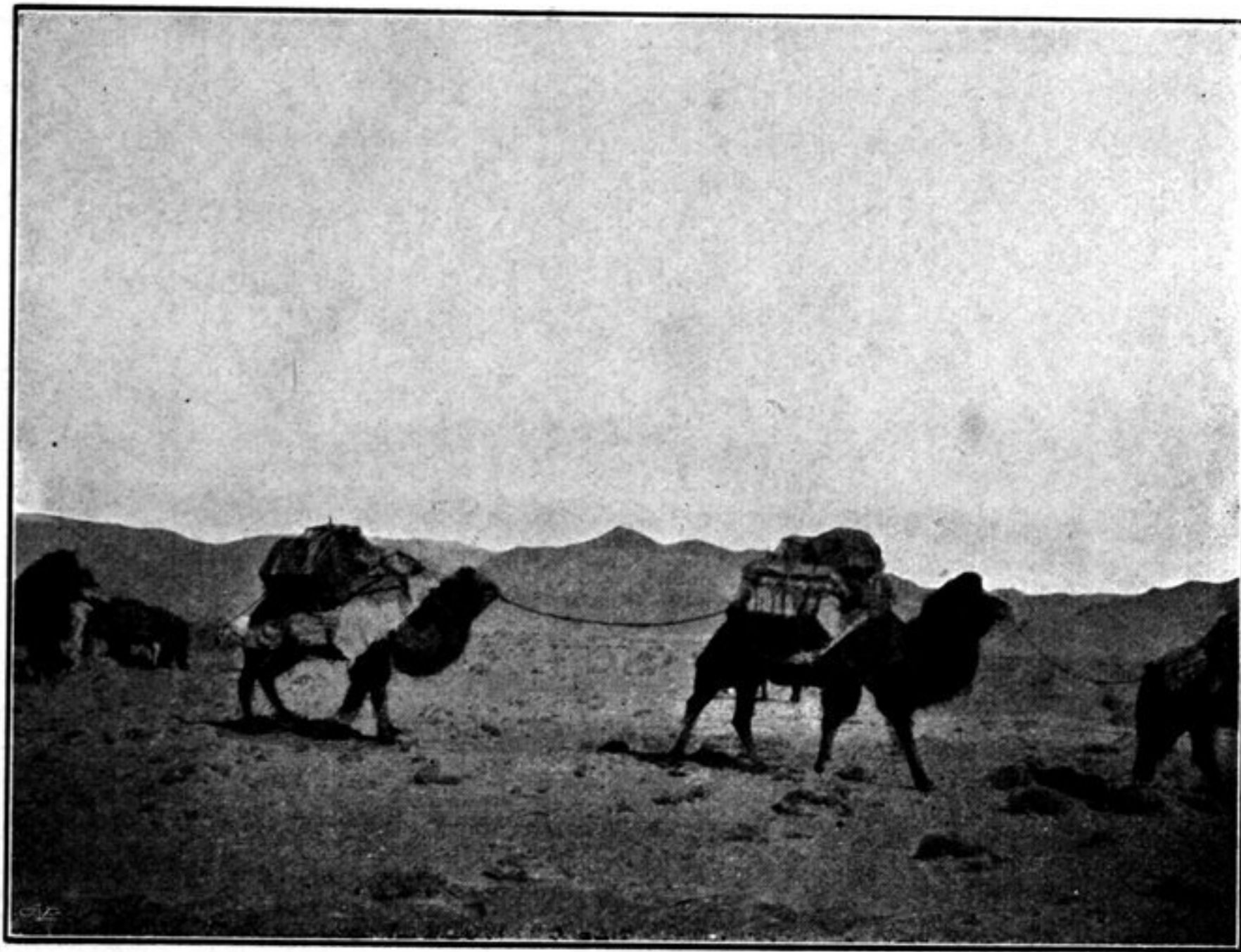
Fig. 246. SOME VIEWS FROM THE OPEN ASTIN-TAGH VALLEY.

northern Tibet from north to south. Indeed similar transitional forms may be observed in one and the same range, e. g. in the Astin-tagh itself, for in its more westerly parts we have found that there exist vegetation, and even water, as for example at Tatlik-bulak and Basch-jol, but here the range is both higher and more