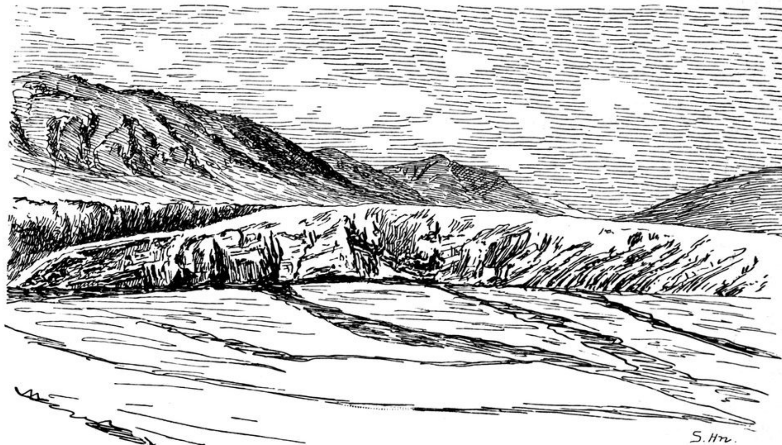
Fig. 417. CAMP VIII LOOKING N.

of our latitudinal valley there is another one similar to it, extending east and west, this too bordered by a not inconsiderable range. In point of fact the Arka-tagh is divided here, just as we found it to be a long way farther east, into a system of