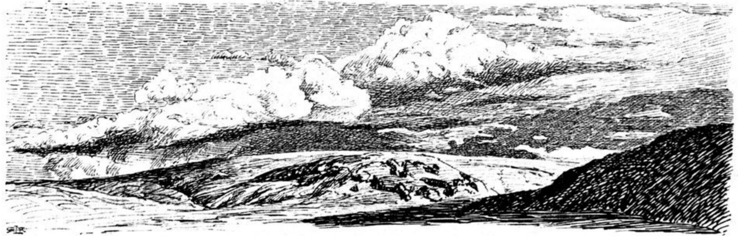
Fig. 429. CUMULUS CLOUDS; LOOKING SE FROM CAMP XIV.

drained by several small brooks that find their way into the salt lake. The great latitudinal valley which we were following, and which constitutes such a striking and characteristic morphological and orographical feature, is itself no doubt divided into a number of minor latitudinal valleys, some containing lakes, others not, but all as a rule drawn out east and west. The country is monotonous, our route traversing a whole series of self-contained drainage-basins, all in external appearance rather like