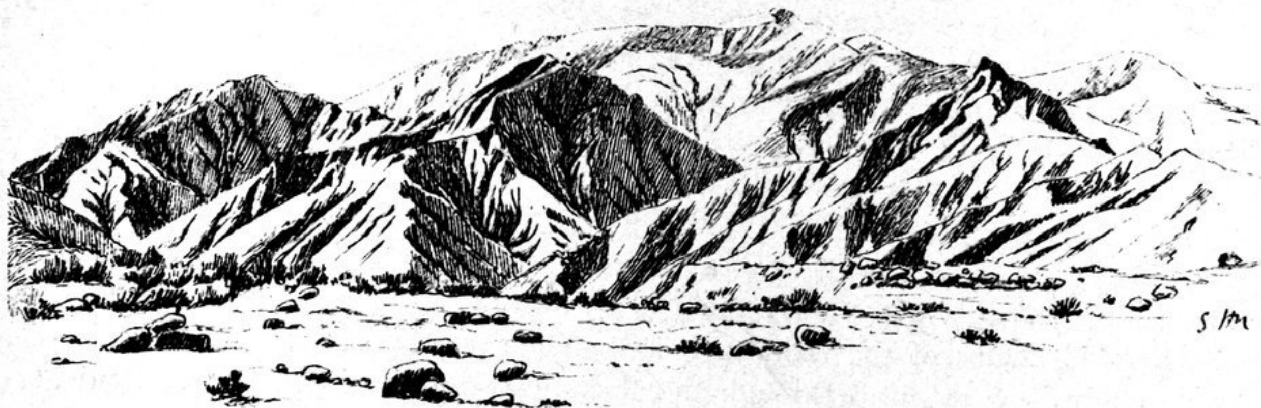
Fig. 457. LOOKING SSE FROM HARATO.

On 3rd October the river had a volume of about 10 cub.m. Leaving it on our right, we proceeded north-north-east up through the Ike-tsohan-namen, a broad side-glen, in which the mica-schist dipped 38^{\circ} towards the N. 5^{\circ} W. The principal