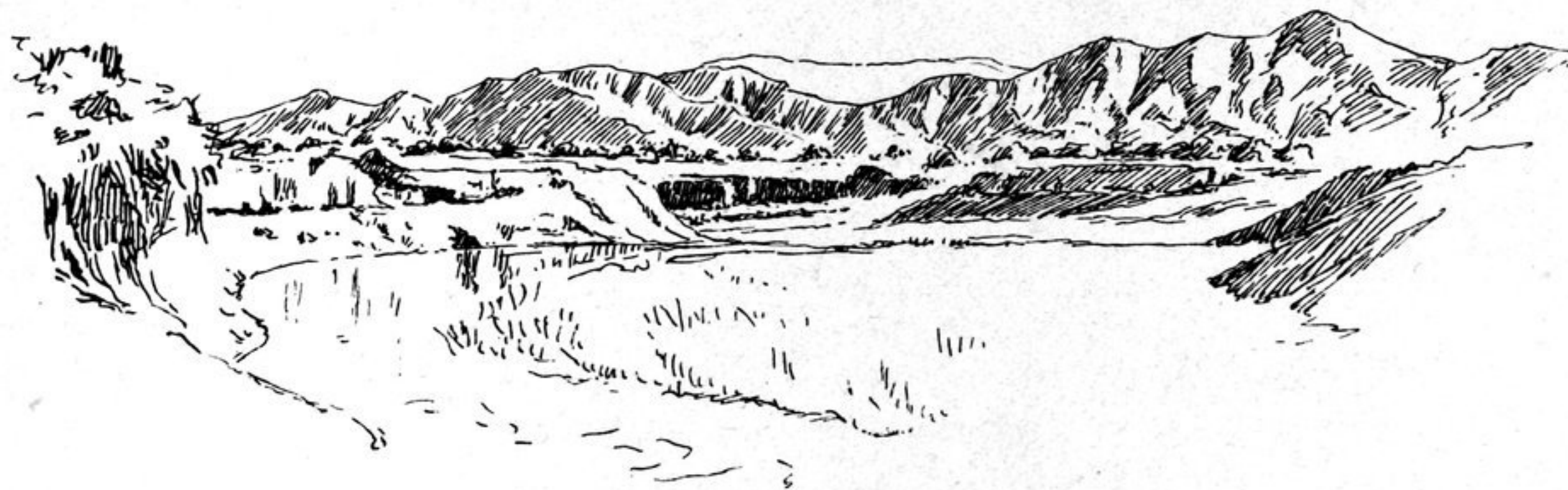
Fig. 459. THE VALLEY OF TENGELIGUIN-GOL, IN TSAJDAM, LOOKING TOWARDS THE MOUNTAINS.

glen runs towards the east, but lower down inclines towards the north, and in a wild, inaccessible transverse glen breaks through the southern border-range of Tsajdam and traverses its plain. The Ike-tsohan-namen leads up to a pass in the main range that forms the westward continuation of the border-range I have just