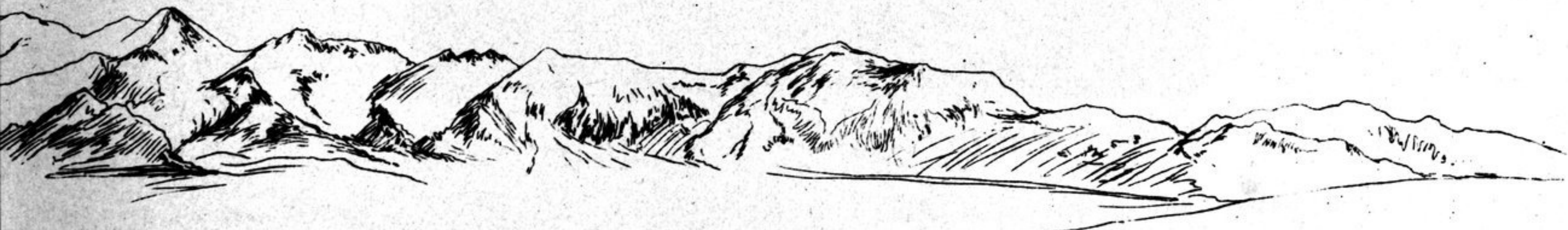
point near Camp CIII