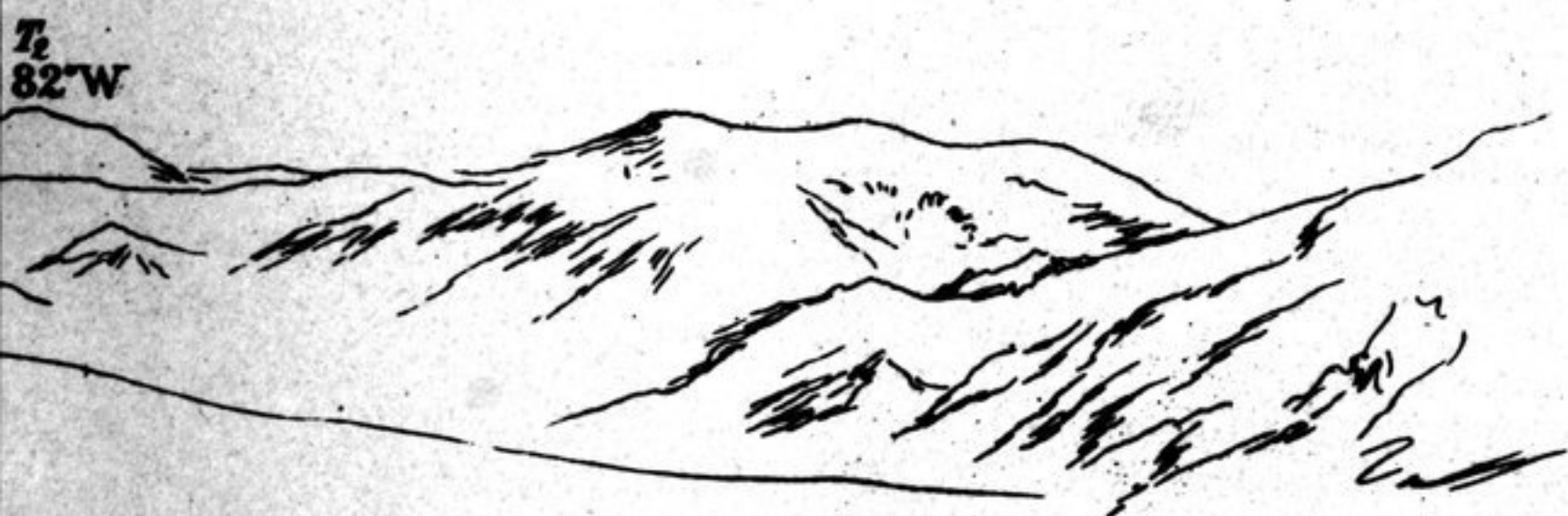
of October 24