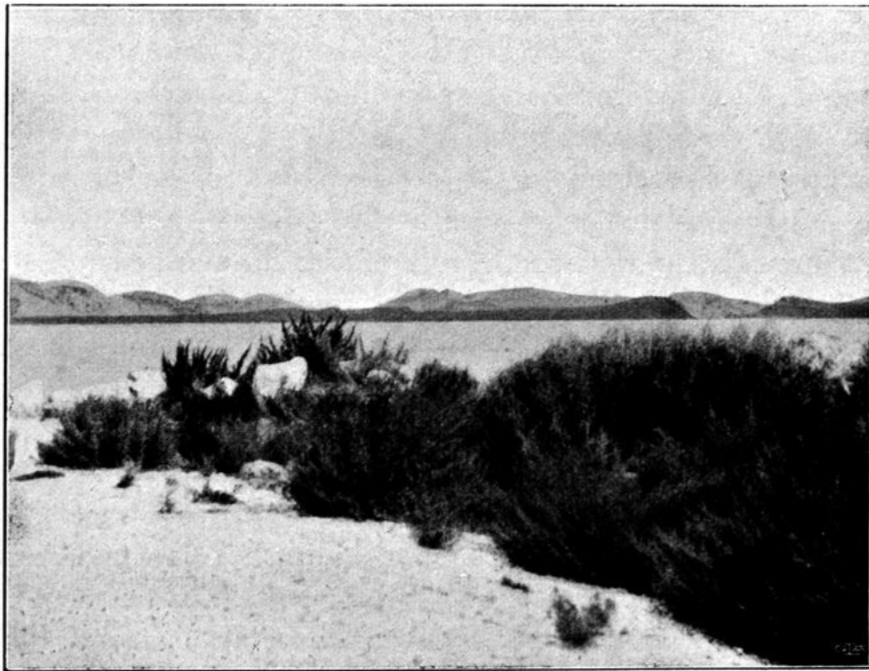
Fig. 53. VIEWS FROM THE SMALL ISLAND OF TSCHARGUT-TSO.

guished, and on the inner side of it was some water. From the north-east corner projects a cape littered with stones.