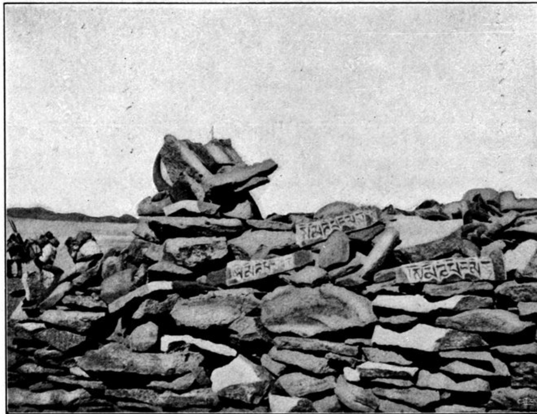
Fig. III. TWO OBOS NEAR LEH, LADAK.

in the shape of one large lagoon and two small ones, all very shallow, on the isthmus. These are situated quite close to the northern shore of the lake, but have no connection with it; they are doomed to a speedy disappearance. The strip of land between them and the principal lake is very narrow and lies only a shade above