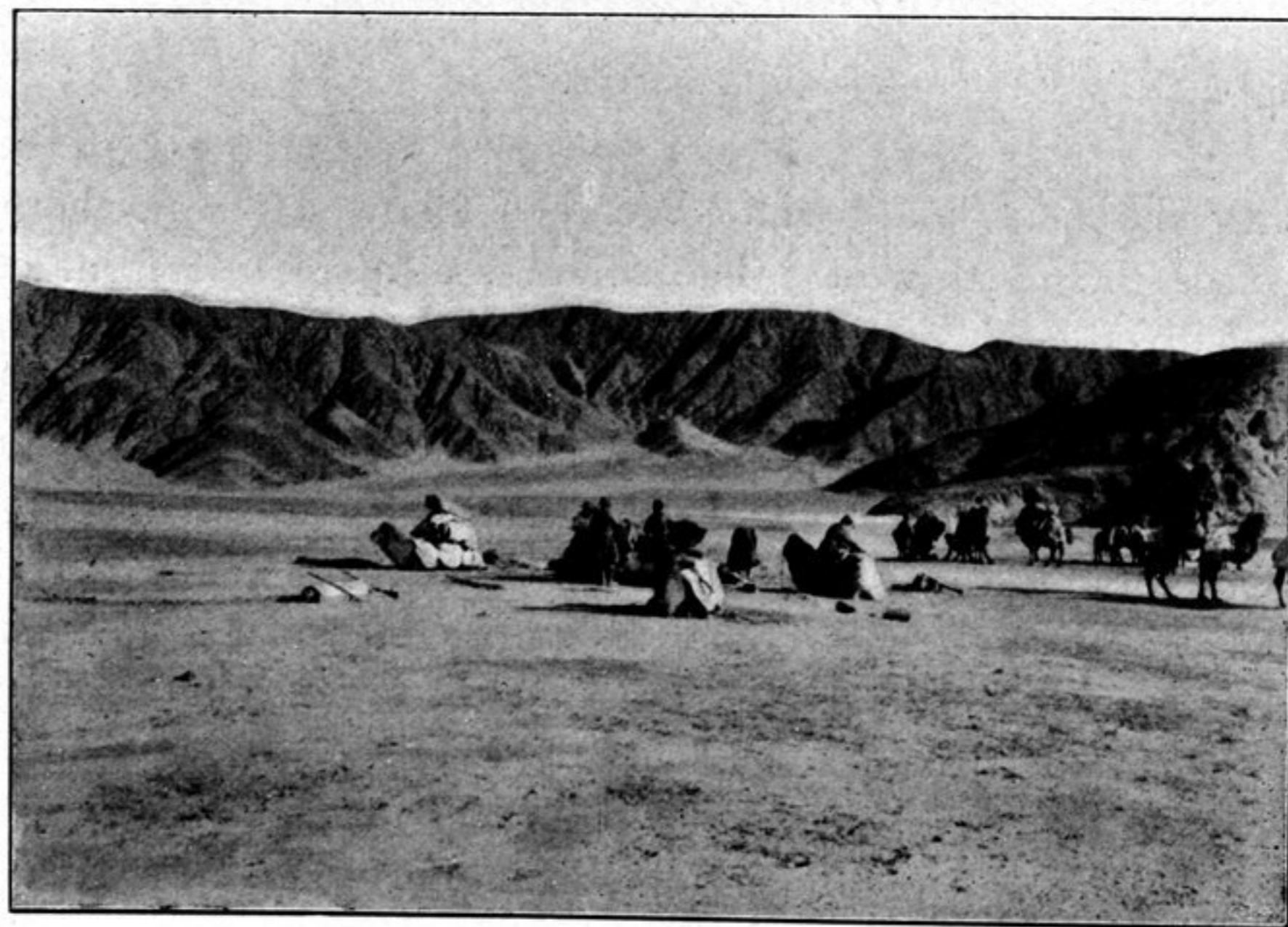
Fig. 172. LOOKING NORTH FROM CAMP CXXXIX.

grass. This section of the river was also perfectly free from ice, and emptied into a third independent lake-basin, which on the contrary was almost entirely frozen over, except for a few open strips of water in the middle, probably due to the current from above.