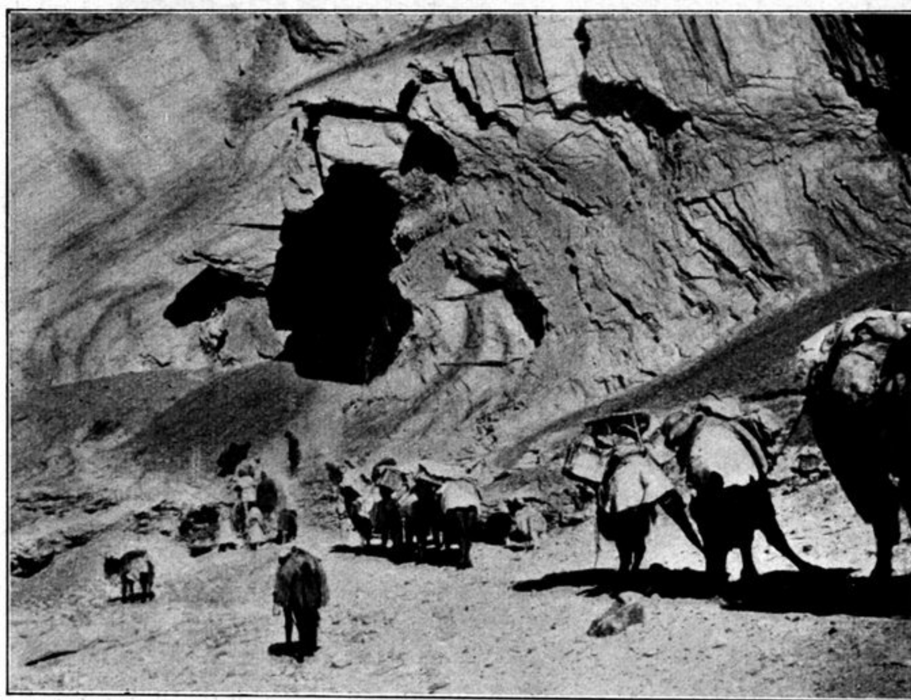
Fig. 174. GROTTOS ON THE SHORE OF PANGGONG-TSO.

The river next enters a tiny basin, at that time entirely frozen over, and after that a larger basin, bigger than any of those it had hitherto passed through, and extending a long distance to the west and north-west. This, the fifth basin, was not frozen, but under the crisp breeze its dark green waters were curling in white foam-tipped waves. Its eastern shore, especially where the lake is narrowest, was