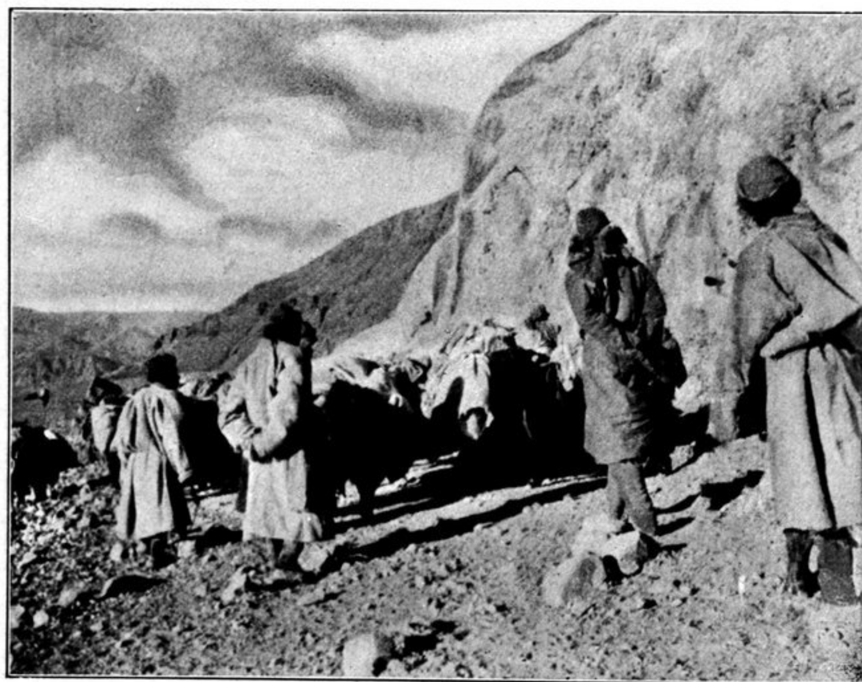
Fig. 209. AT THE WESTERN END OF TSO-NGOMBO.

alongside the Tso-ngombo just during the days when it was freezing over, I had an opportunity to observe how the formation of the ice advanced from east to west; or in other words, how the easternmost basin froze first, then those successively that followed next after it, yet in such wise that the narrow and sheltered parts of