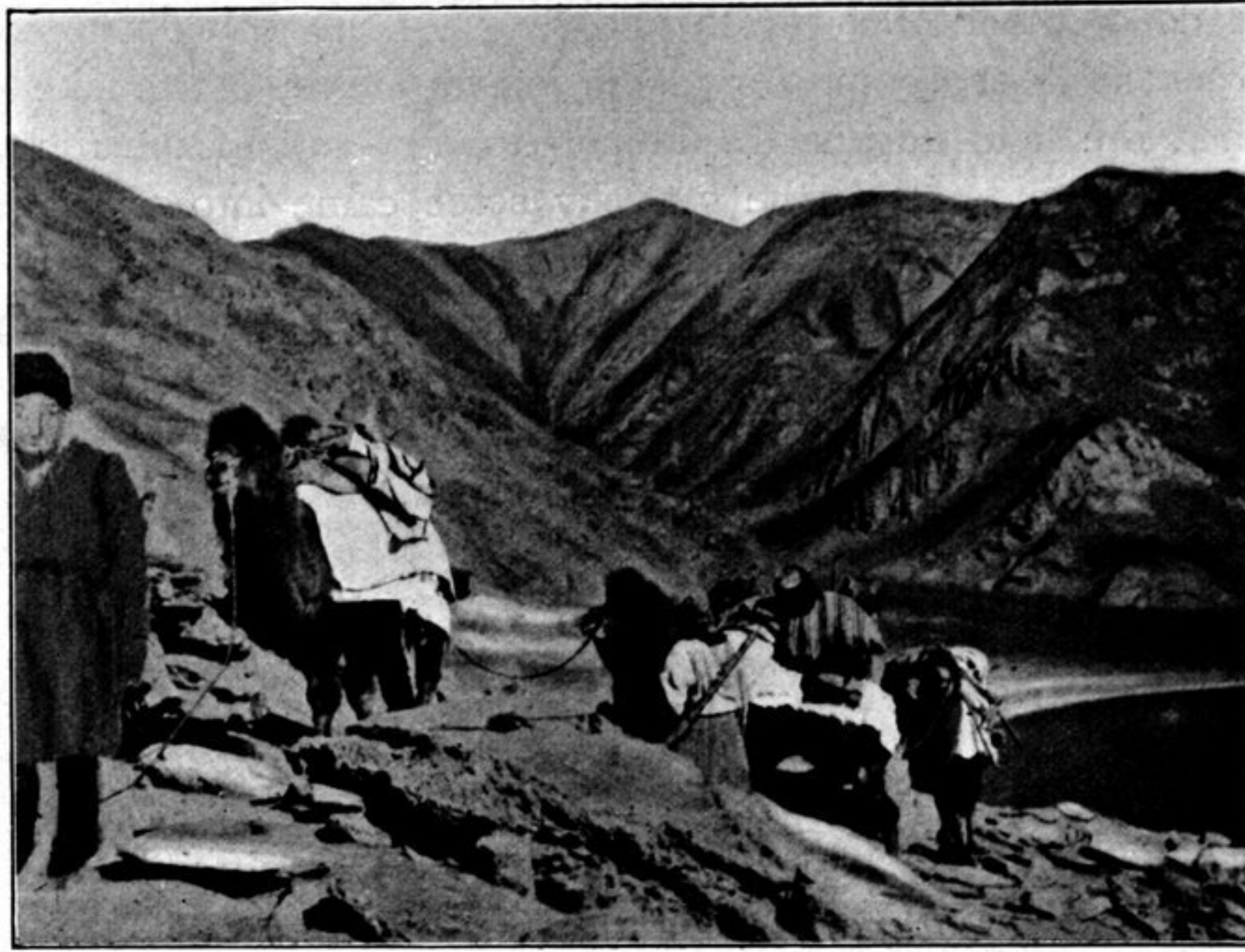
Fig. 242. A TYPICAL BAY OF THE NORTHERN SHORE OF PANGGONG-TSO.