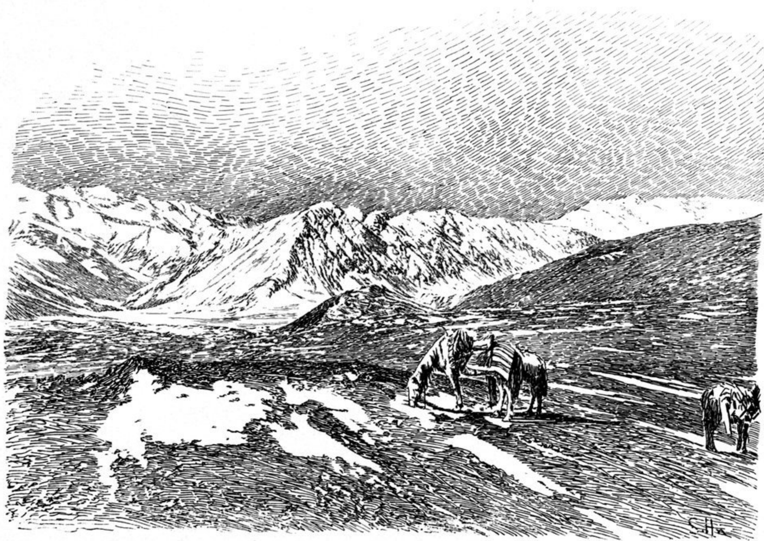
LOOKING N 76° W FROM THE LAST PANGGONG-TSO PASS.