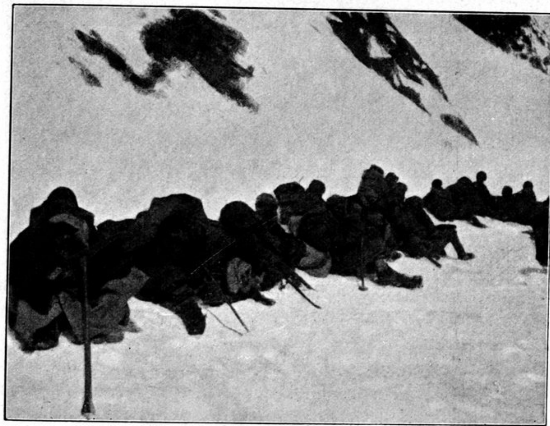
Fig. 292. GROUPS OF MY LADAKI COOLIES.

this pass is a good deal lower than the two that I have already mentioned. The road again runs like a shelf on the side of the slope, and was in so far difficult and tiring that it was covered with hard-trodden snow, as slippery as ice. Here and there on the slope stands an occasional coniferous tree, though quite stunted in