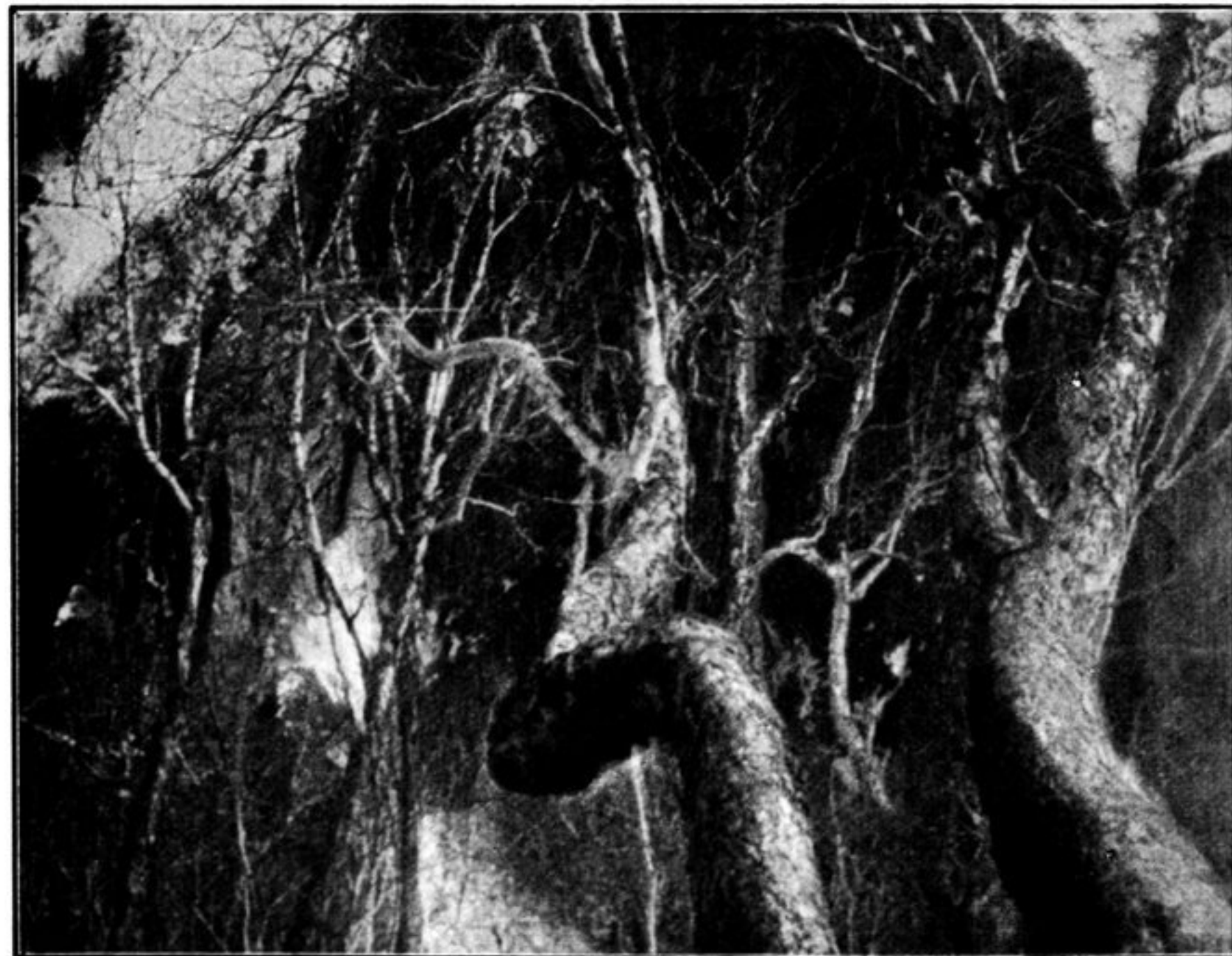
Fig. 296. ON THE SLOPES OF SODSCHI-LA, JANUARY 1902.

where the actual water-divide was situated. But it is the mountainous character of the country on the south side of the pass that makes the Sodschi-la so dreaded, and generally keeps it closed for a certain part of the winter, or at any rate makes it