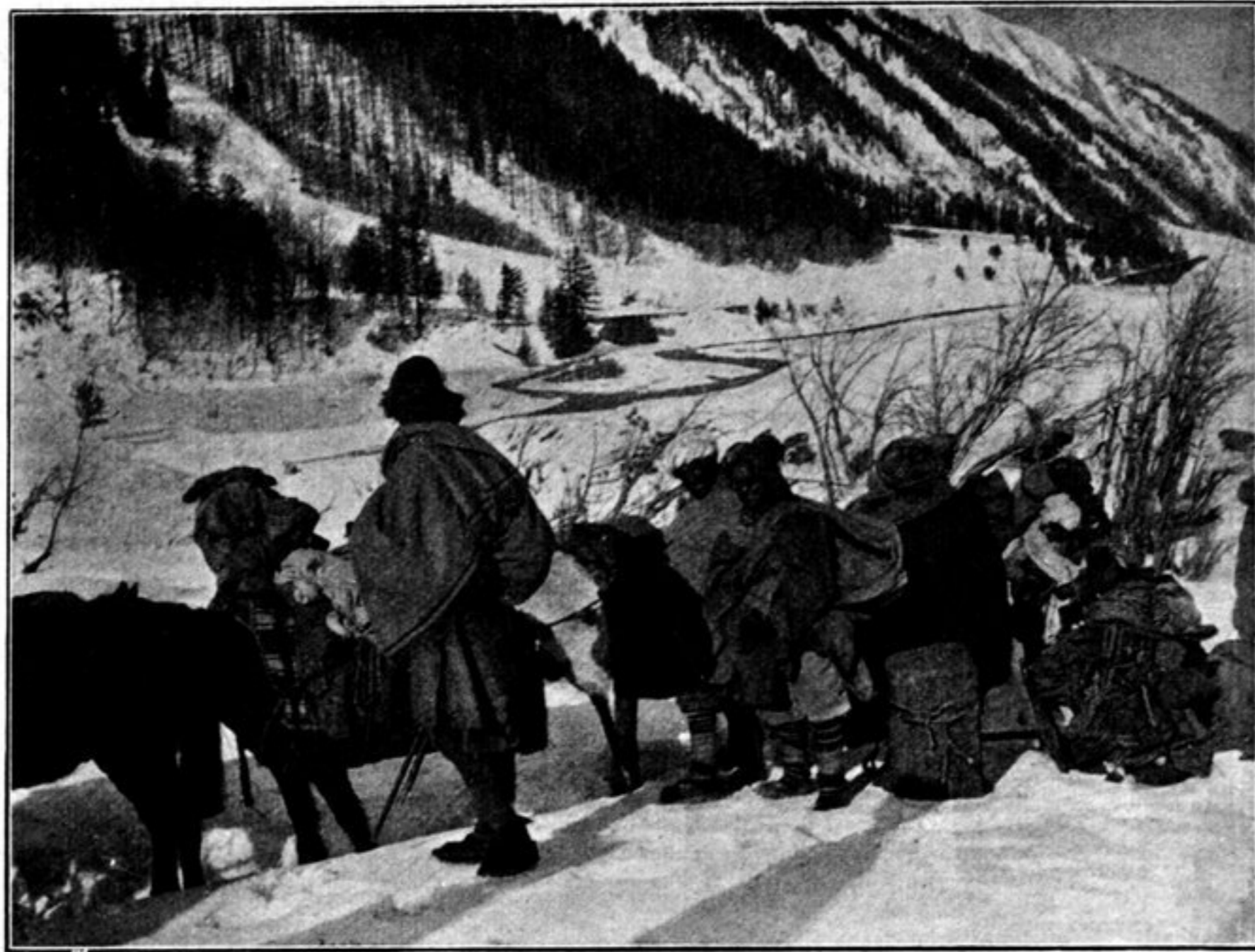
Fig. 302. THE SAME.