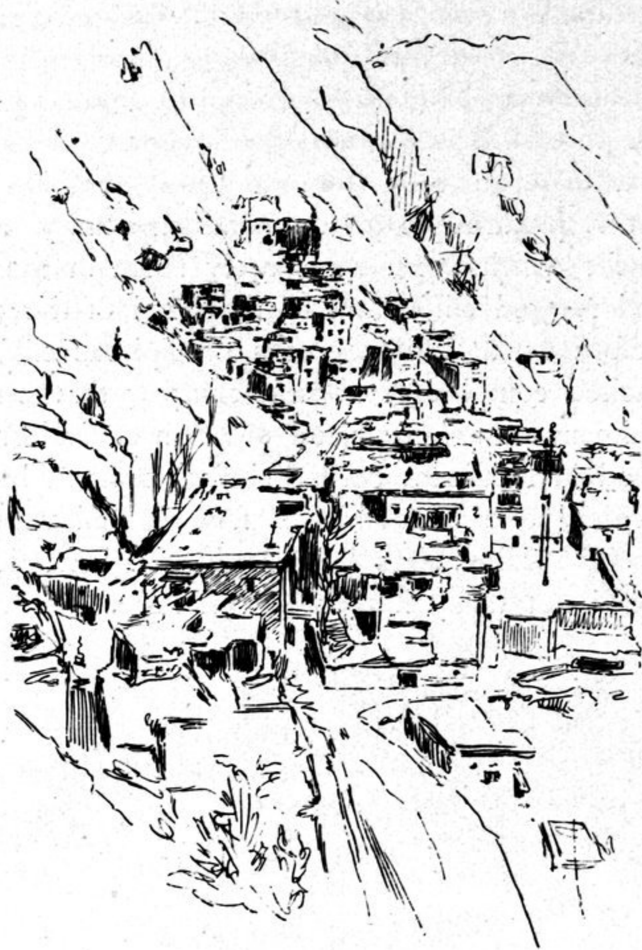
Fig. 307. HEMI-GOMPA AS SEEN FROM ABOVE.