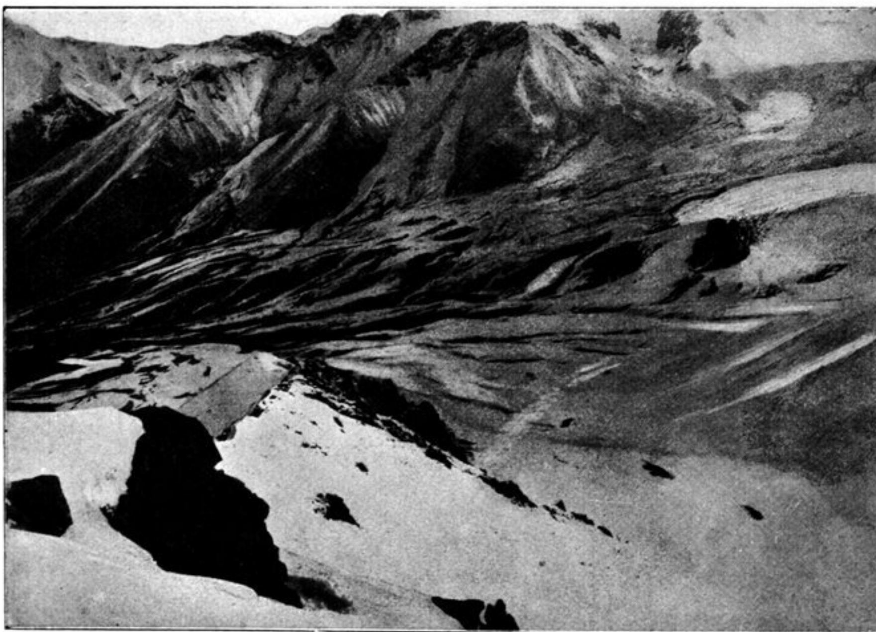
Fig. 348. VIEWS FROM THE SANDSCHU-DAVAN.

May 4th. The day before we had, as it were, passed from winter to spring; we now passed from spring to summer. Flies, gadflies, and insects of every sort now began to make their appearance. The sun beat hot, and the heat was reflected