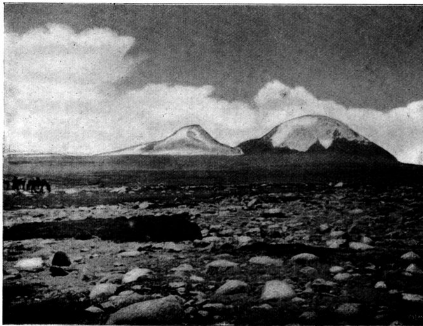
Fig. 377. SOME VIEWS OF ISOLATED GLACIATED MOUNTAINS IN CENTRAL TIBET.

will beyond doubt reveal a number of lakes which, like the Lakor-tso, have subsided more than 100 m., judging from the evidence afforded by their old strand-terraces. The shores of the Lakor-tso lie 200 to 300 m. lower than the country which immediately encircles that lake. As a rule the lakes which have disappeared