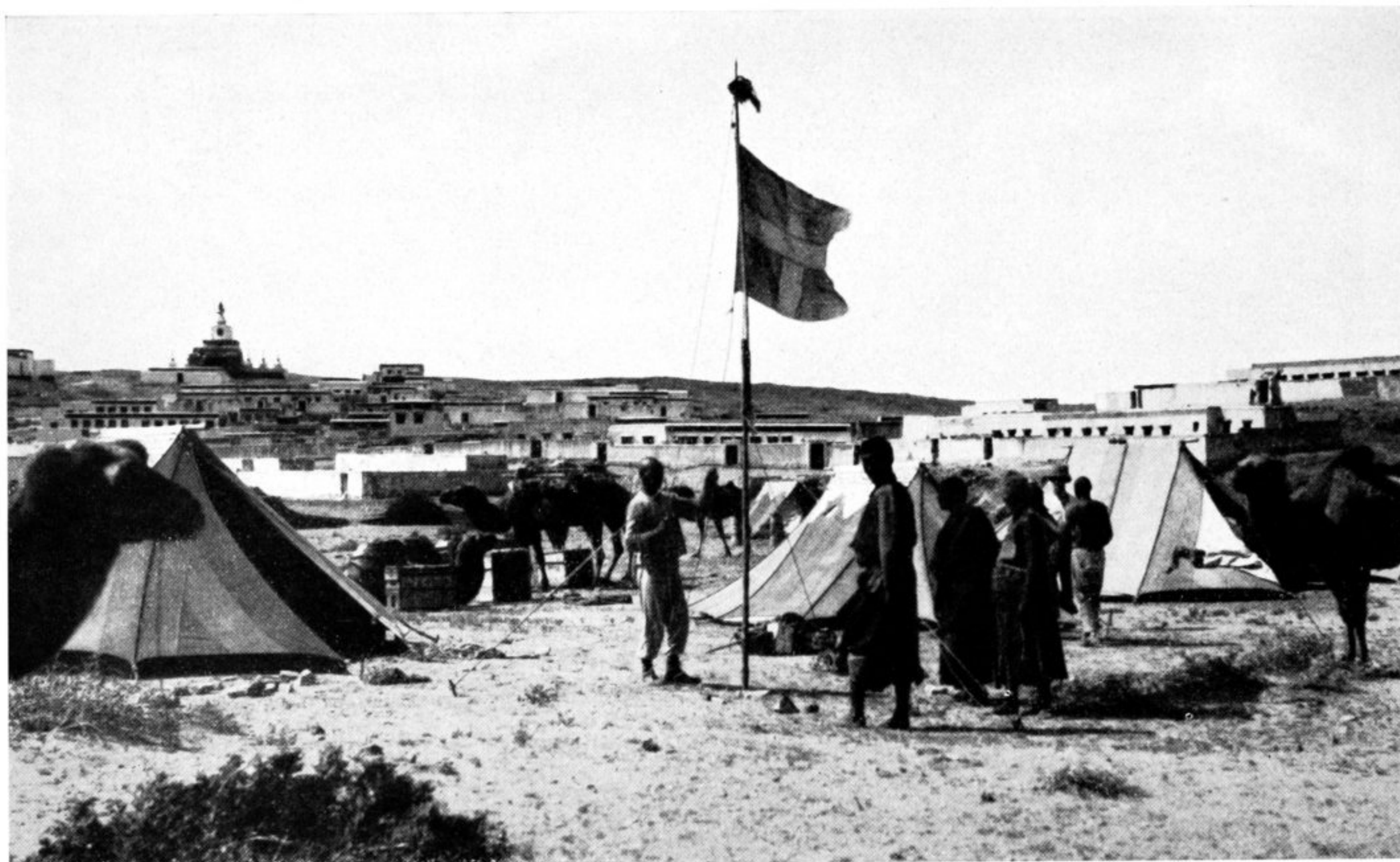
Our camp in front of the temple-town of Shande-miao