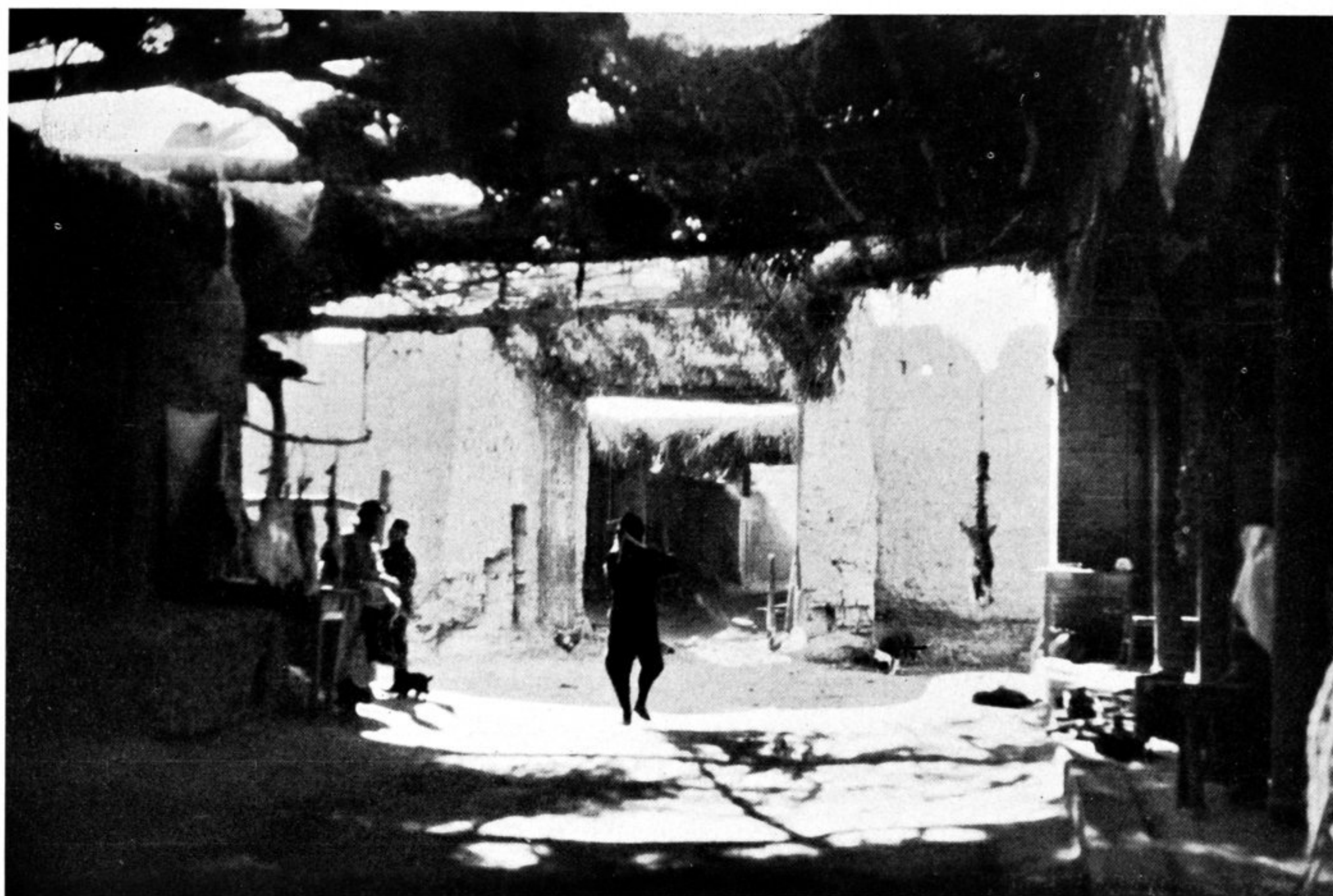
The covered bazaar of Pichan