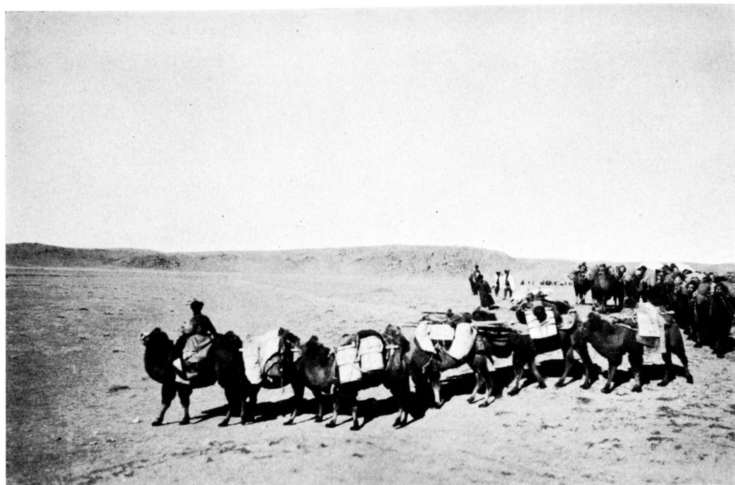
The caravan of the Gobi-group starting on November 11th 1929