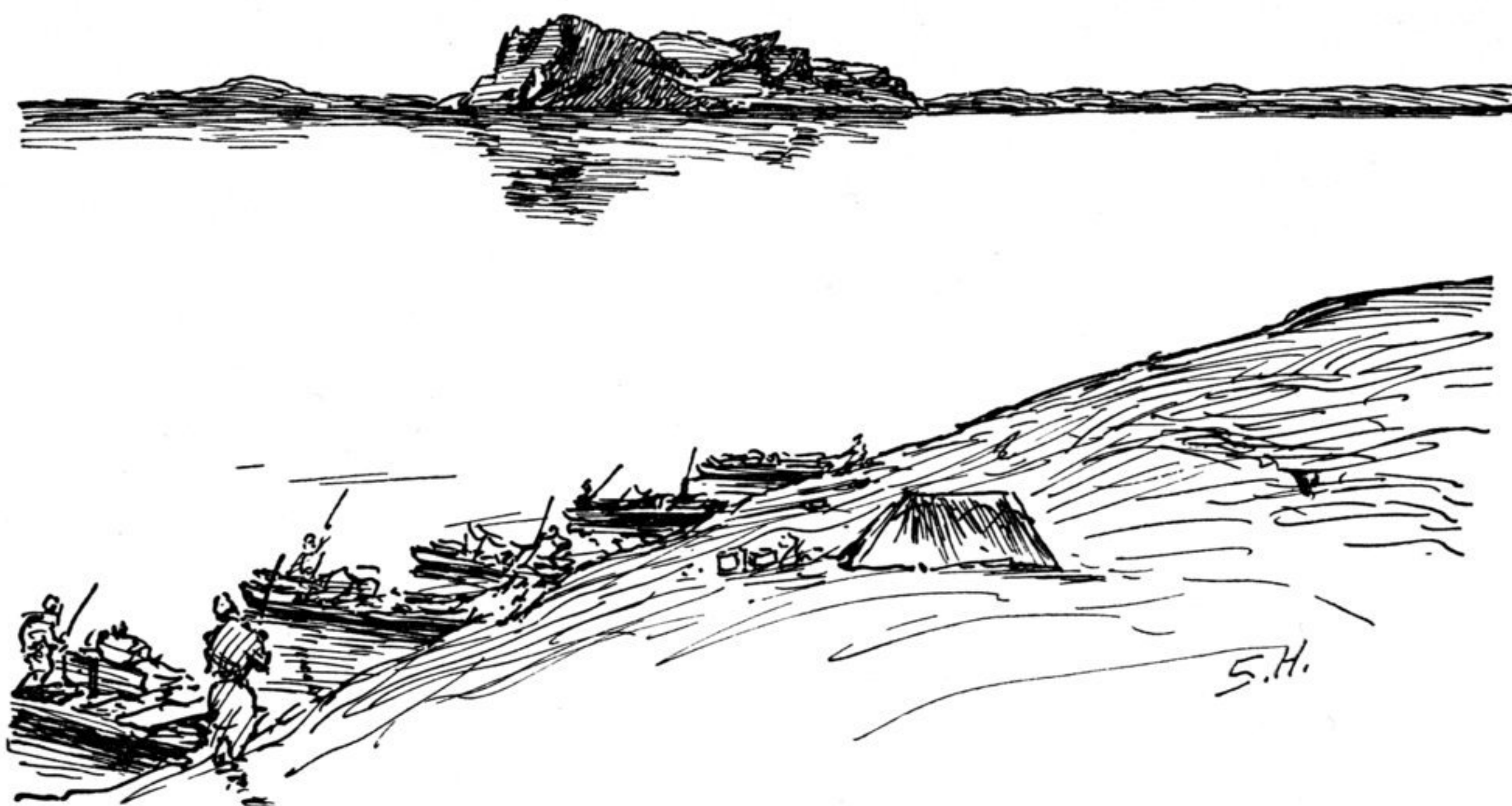
Fig. 17. Mesa island south of T'u-ken

the river with any current; but they had found the ruins of a fair-sized house on the mainland to the north-west. CHEN suspected at once that this was the fort T'u-ken, discovered by the archaeologist HUANG WEN-PI during our expedition in 1930. About nine o'clock we got into a double canoe and paddled over to the spot over open water free of reeds. It took scarcely half an hour to reach.