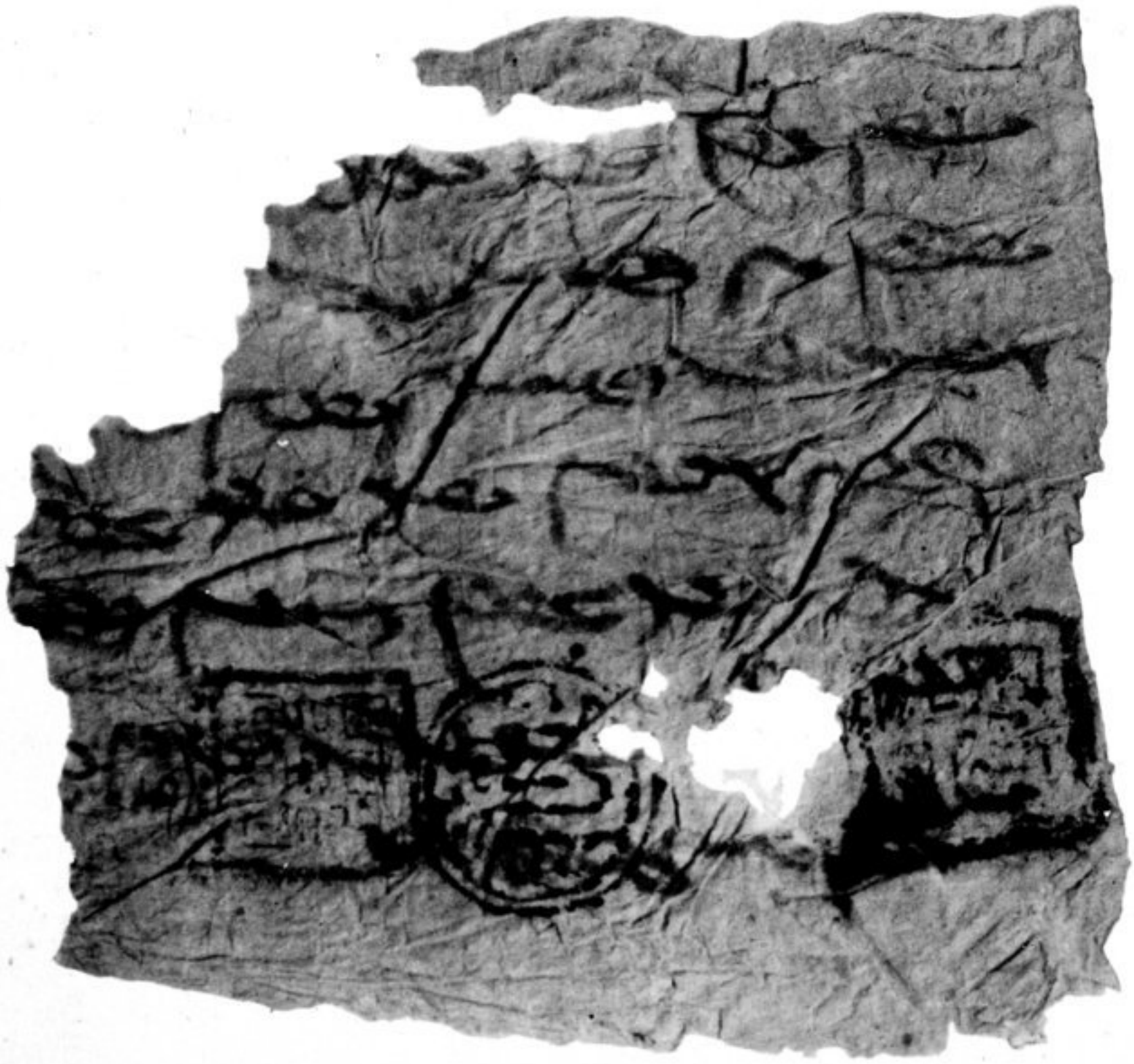
(10) (1) 回鹘文书断片(喀喇和卓) (2) 突厥文书断片(吐峪沟) (3) 同上(摩木吐喇)