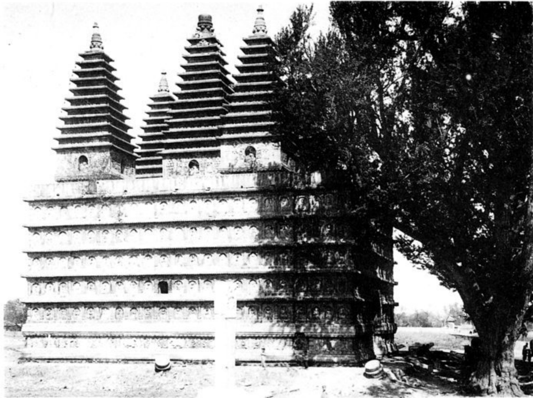
シベク驚ニ誠トコルナ巧精其リアシ刻彫像佛ノ多幾ニ側四ノ塔 寺塔五 The Five Pagodas in the Woo-Ta Temple.