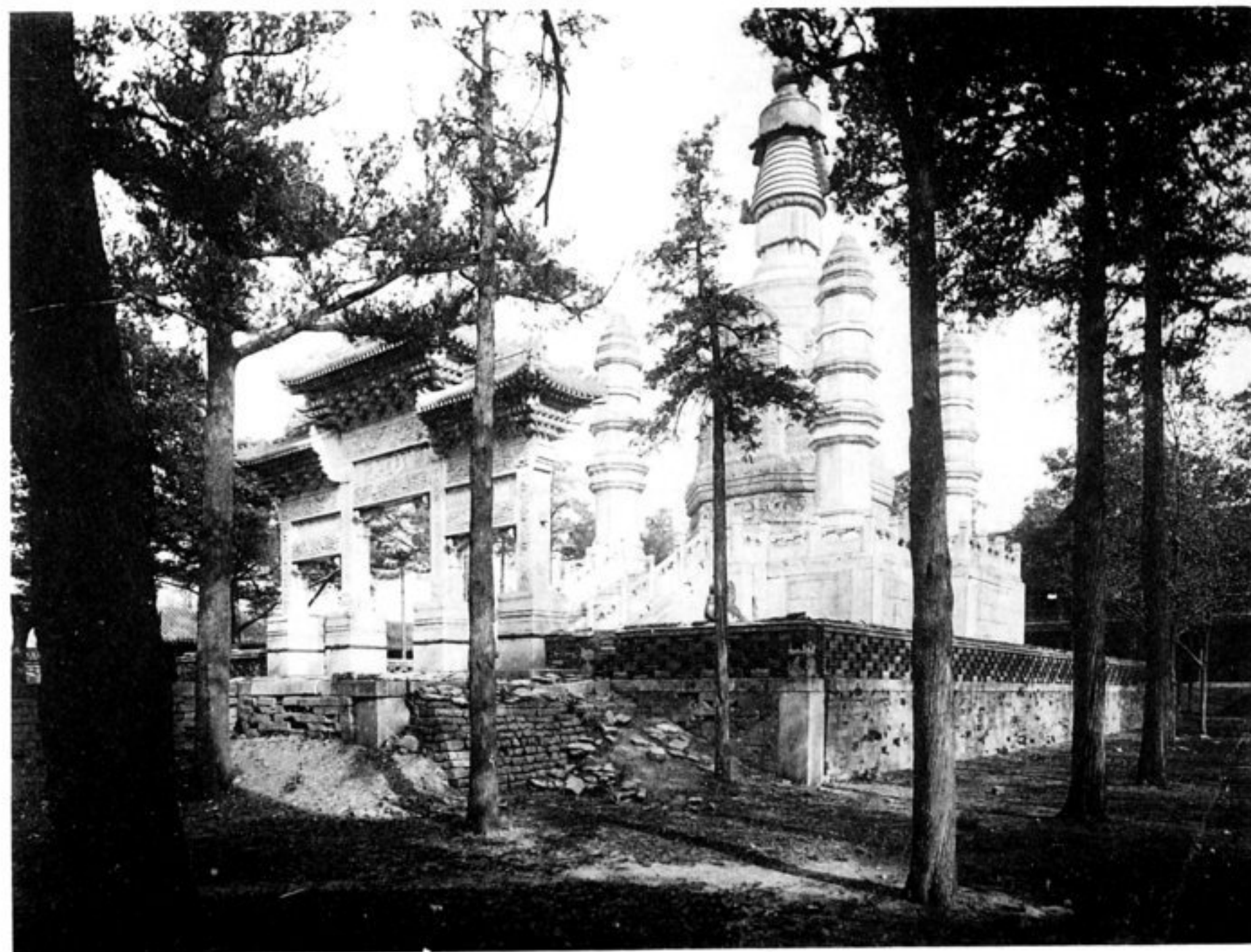
リアニ内庭喇ルニアニ近附ノ場兵練旗八外門定安 塔寺黃 (Peking) The Marble Pagoda in Howan Temple.