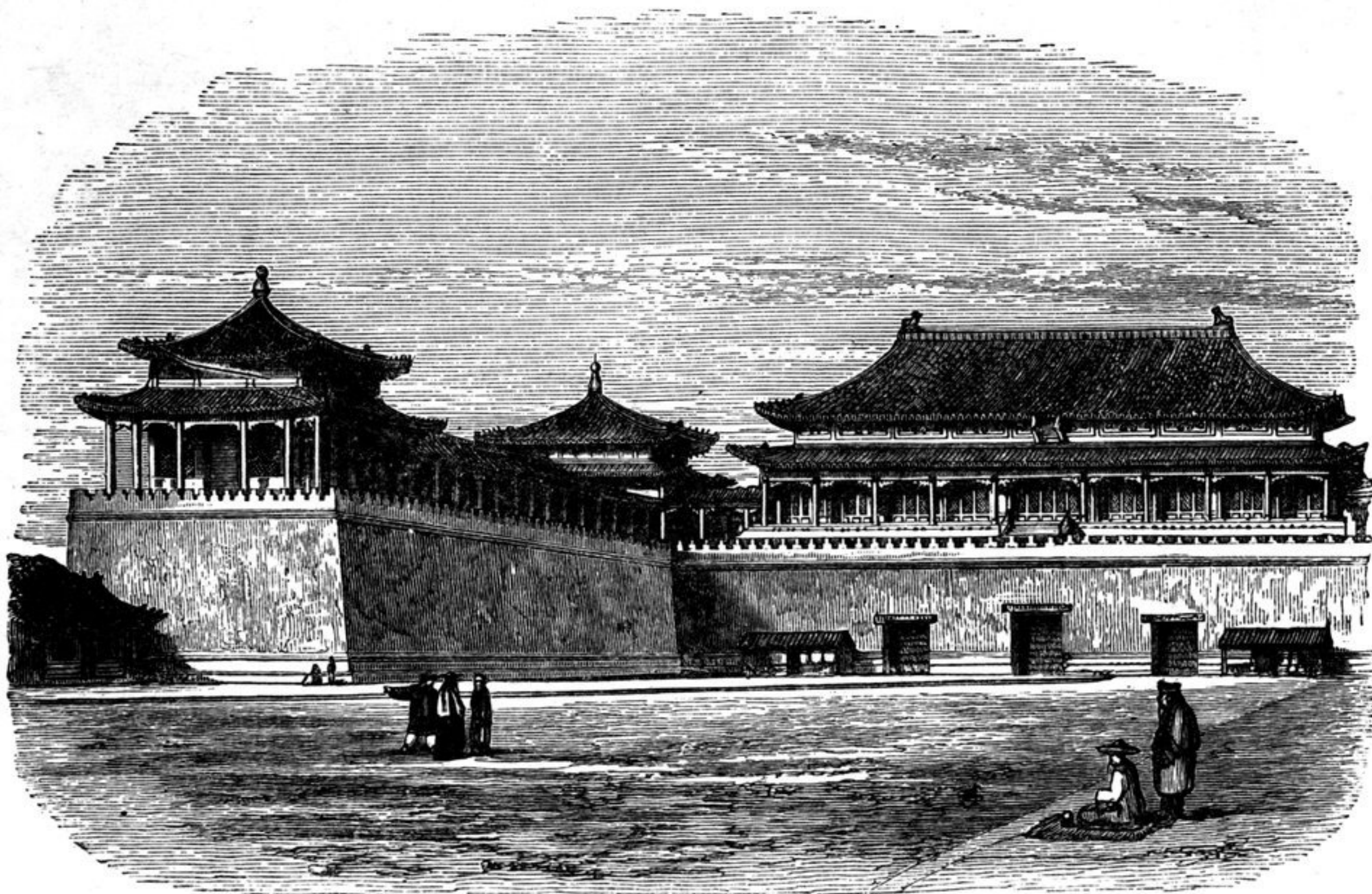
Winter Palace at Peking.

of the Chinese author). Marco Polo states that the basement of the great palace 'is raised some ten palms above the surrounding soil.' We find in the Ku kung i lu : 'The basement of the Ta-ming tien is raised about 10 ch'i above the soil.' There can also be no doubt that the Ta-ming tien stood at about the same place