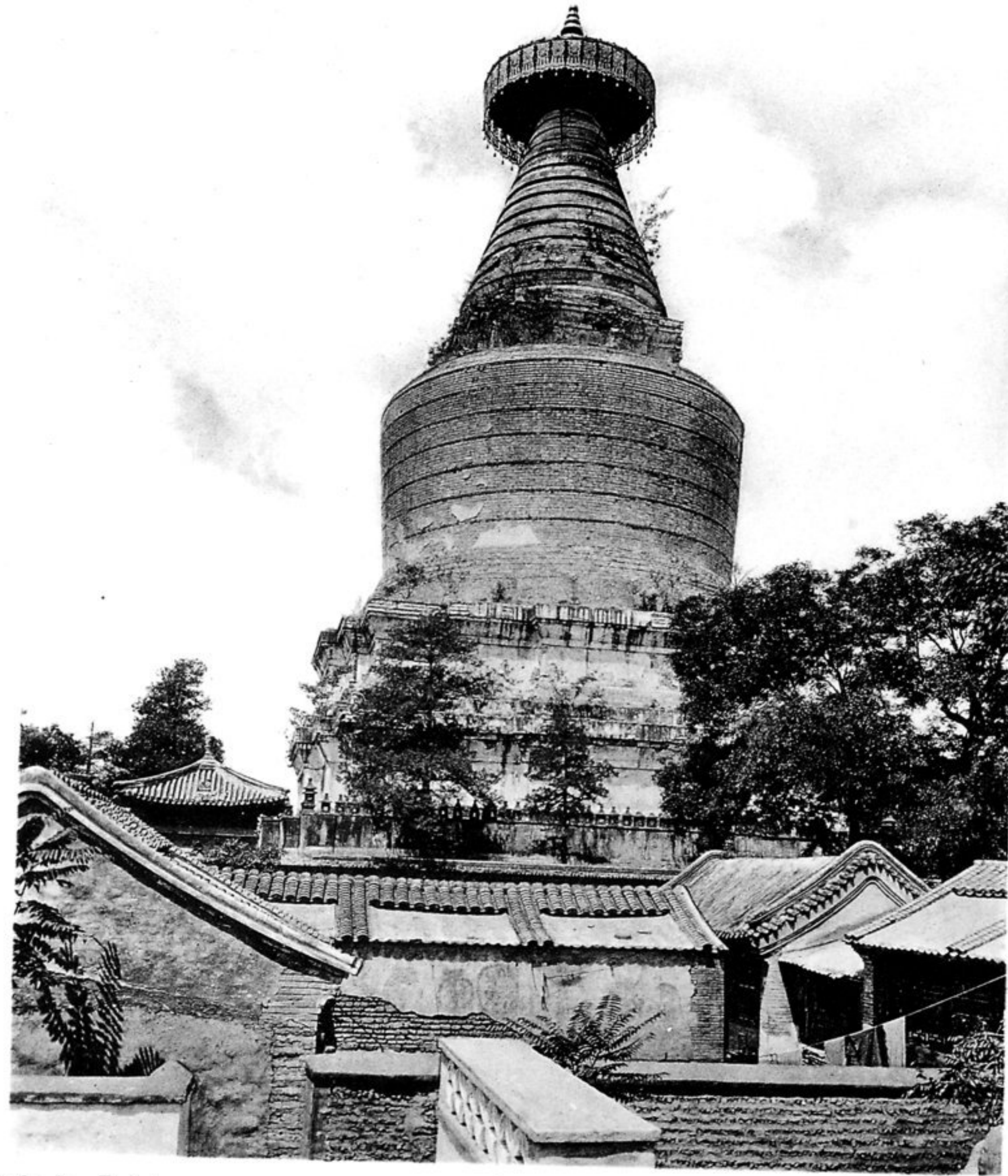
Die Pagode im Pai-ta-sze.