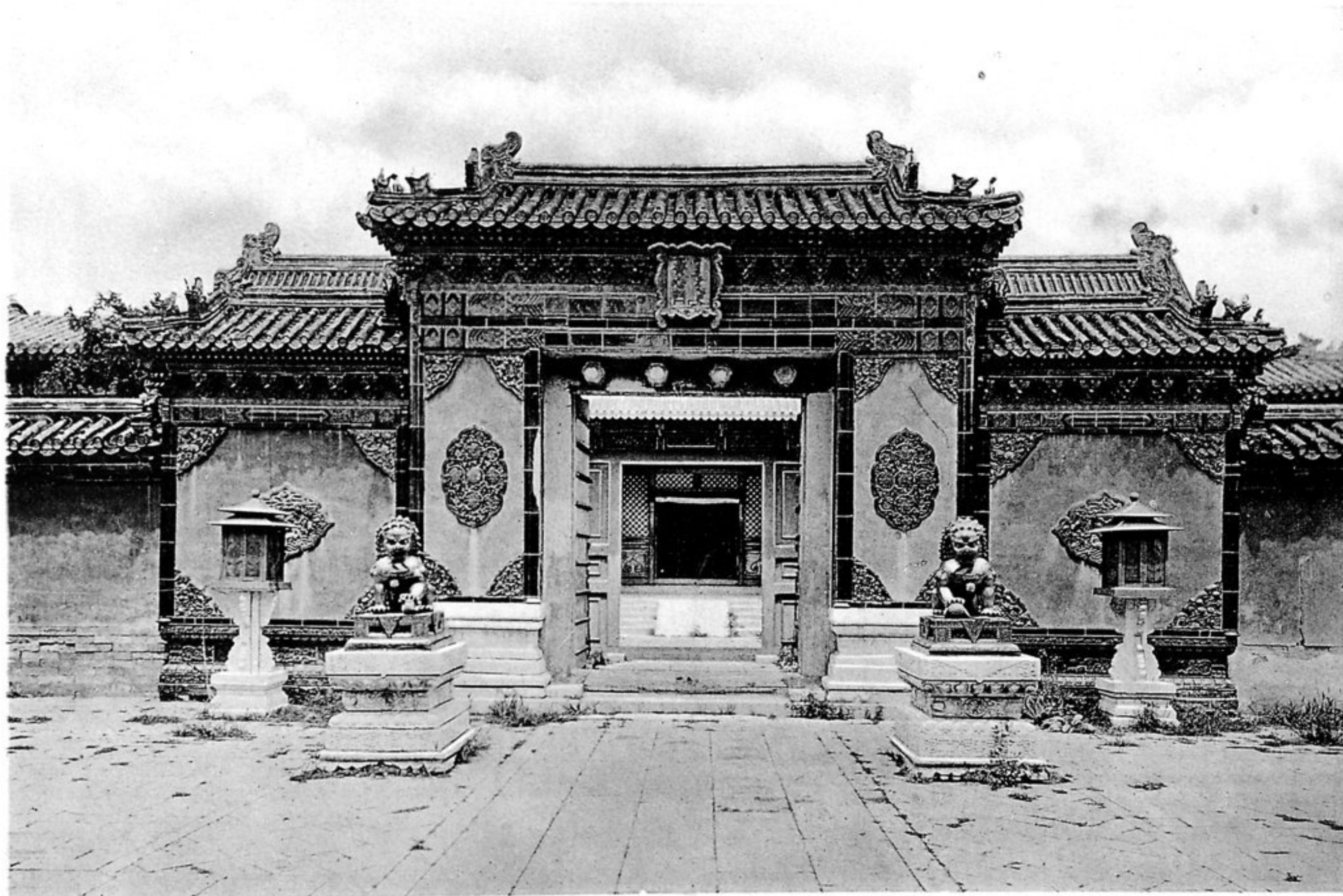
Yang-hsin-mên, Eingang zu den Gemächern des Kaisers.