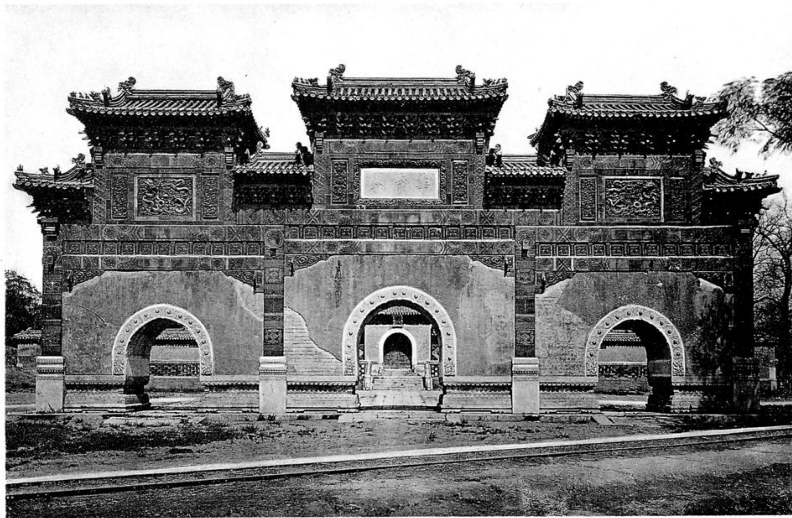
Pailou am nördlichen Lotosteich.