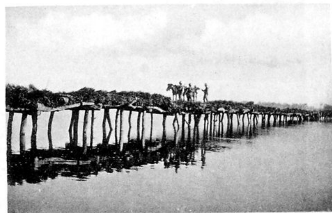
Übergang über den Peiho.