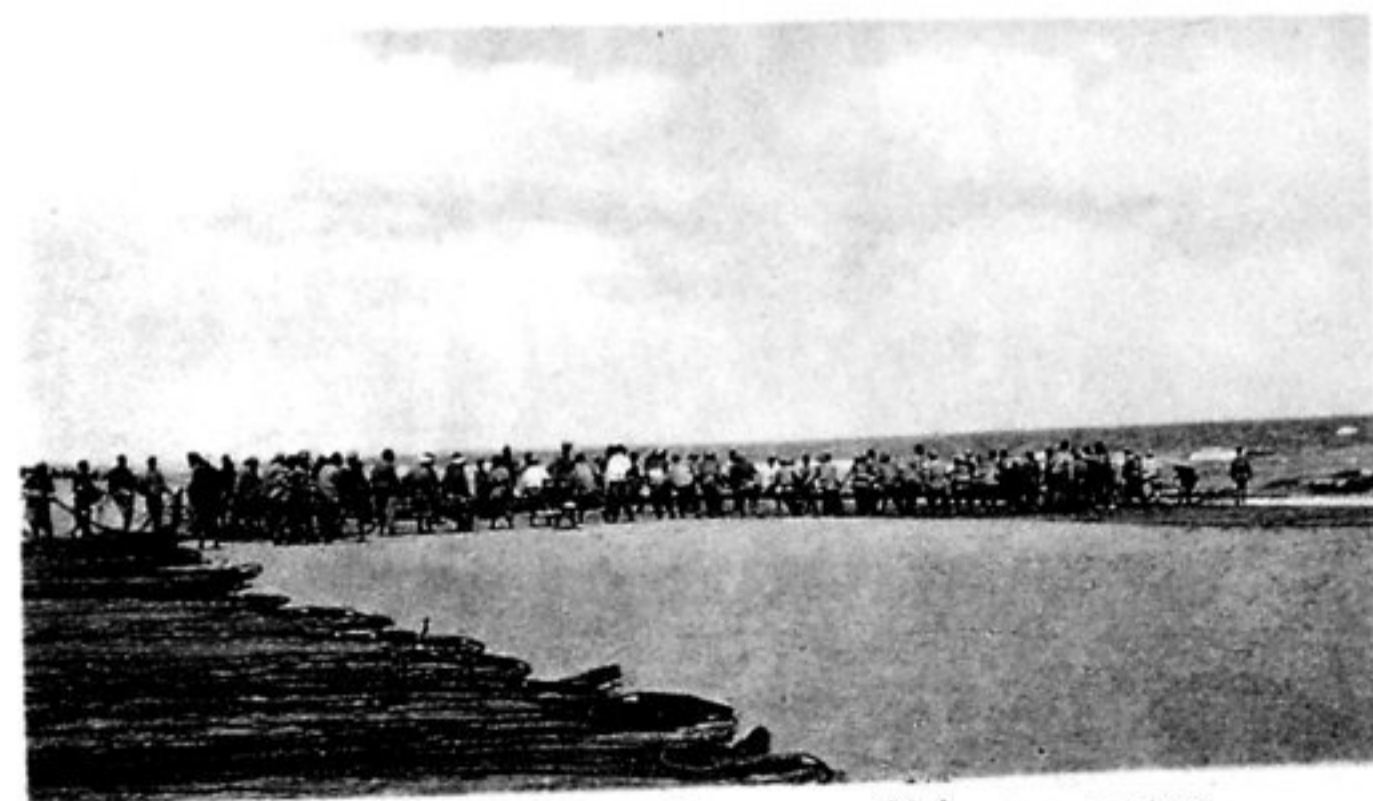
Fischer am Strande von Chinwang tao.