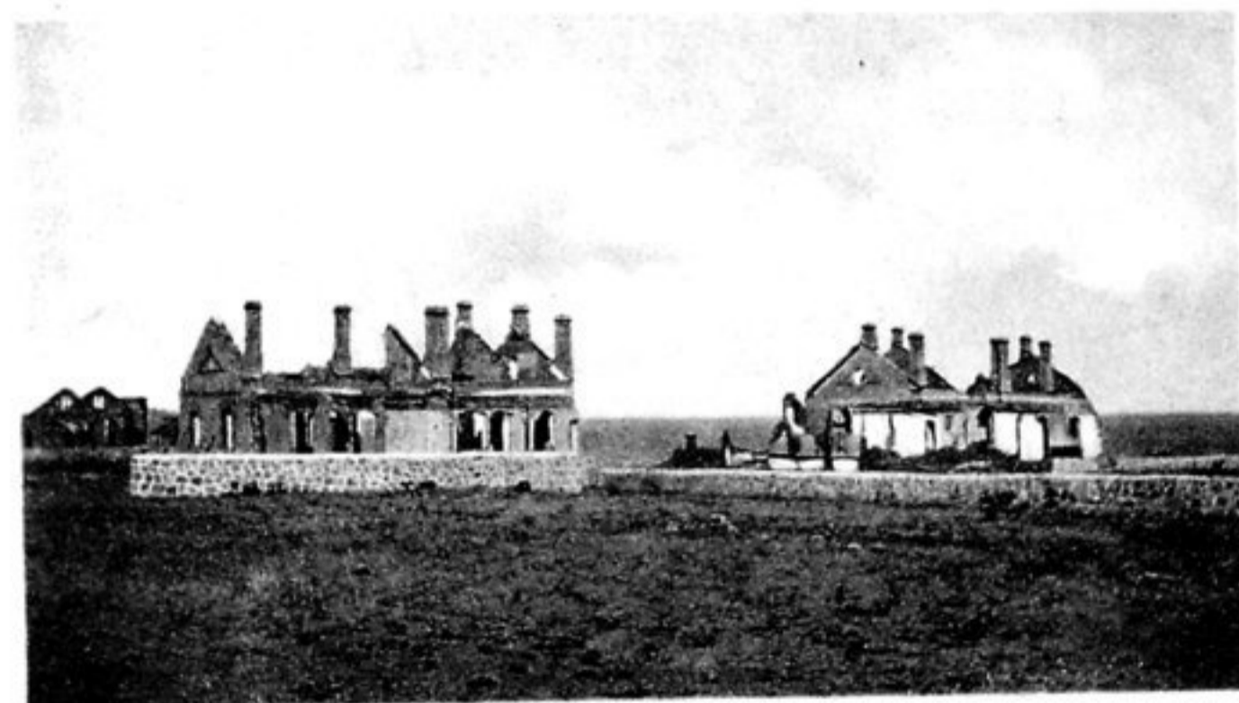
Zerstörte Villen in Peitaiho.