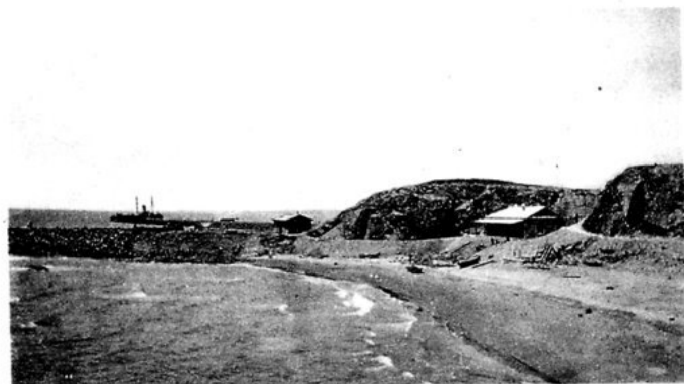
Bucht von Chinwang tao.