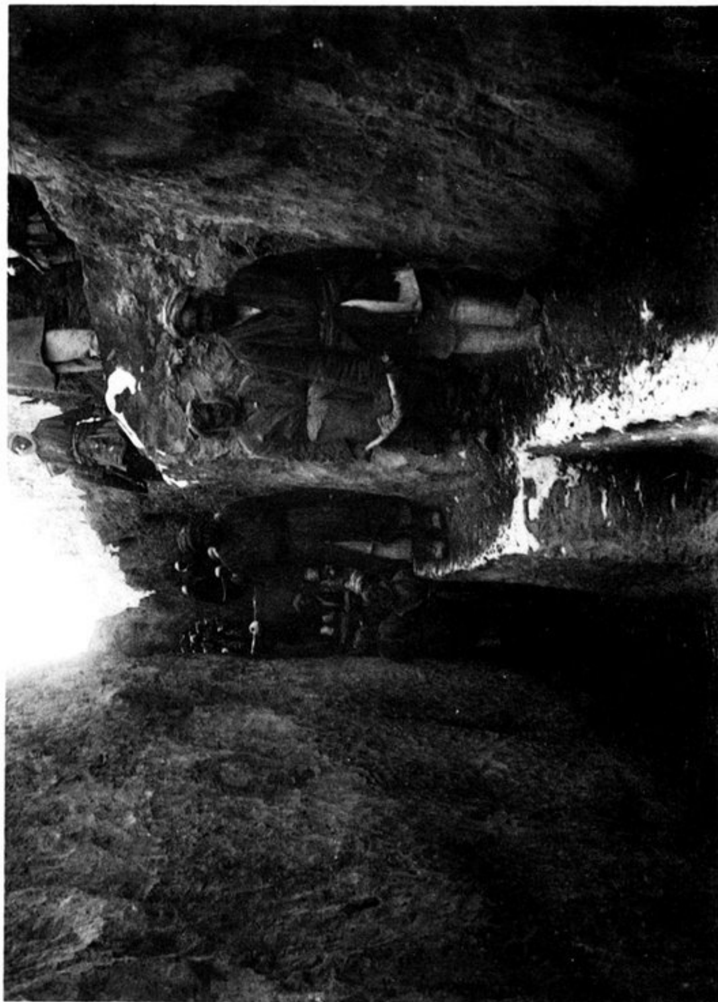
c) TRANCHÉE DE PROSPECTION.