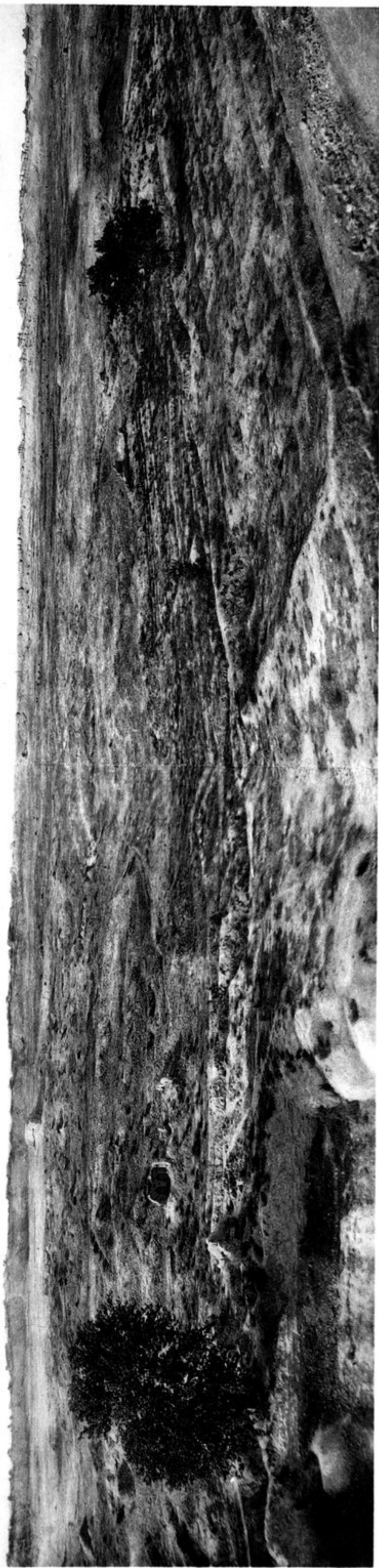
a) PANORAMA DE LA PARTIE MÉDIANE.